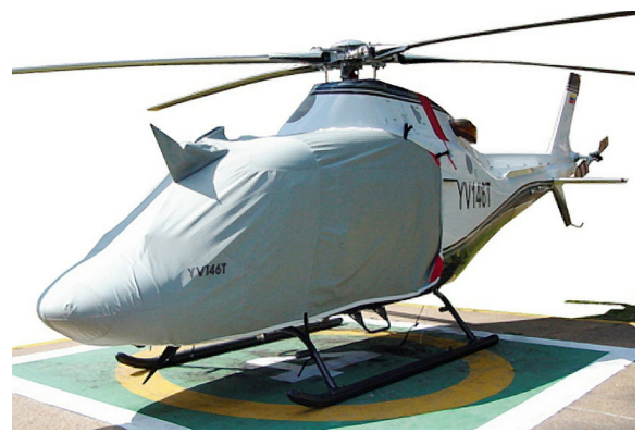
Koala Bubble Cover (with Wire Strike)