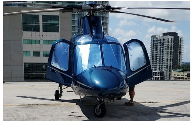
Agusta AW109 Power, A109E Heatshield Set