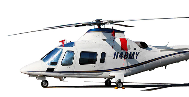
Agusta Power Pitot Covers, Intake Covers, and Cockpit Heatshield set

WINTER USE MATERIAL - Made with Solution-Dyed Polyester fabric, this option is intended for seasonal use to aid in deicing, rain mitigation, or for occasional travel. The material is lighter and more compact, but more susceptible to UV damage and may have a shorter useful life if used continuously outside than the all-year use material.