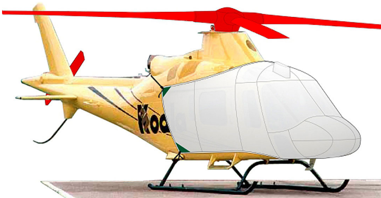
Koala Bubble, Rotor Hub, Blade & Tail Rotor Covers (illustration)