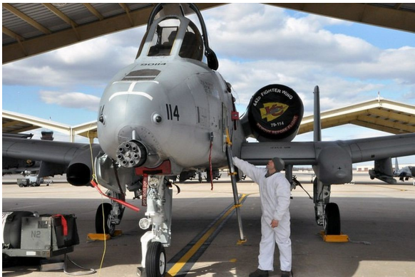
Fairchild A10 Intake Covers & Nose Gun Scoop Plug