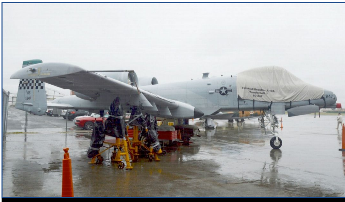
Fairchild A10 Thunderbolt Canopy Cover