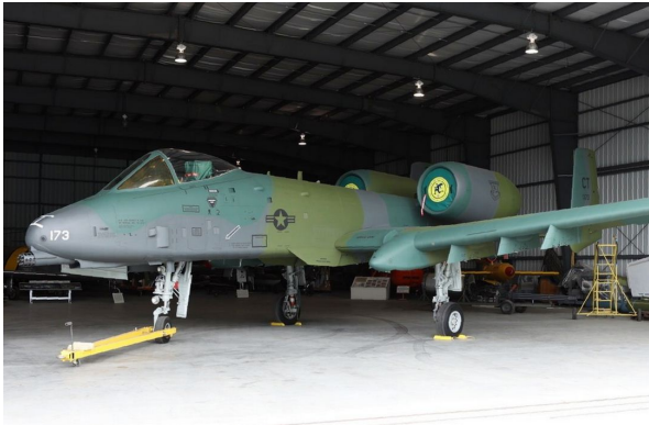
Fairchild A10 Intake Plugs, non-folding type