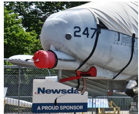
Fairchild A10 Thunderbolt Nose Gun Cover, Gun Scoop Inlet Plug