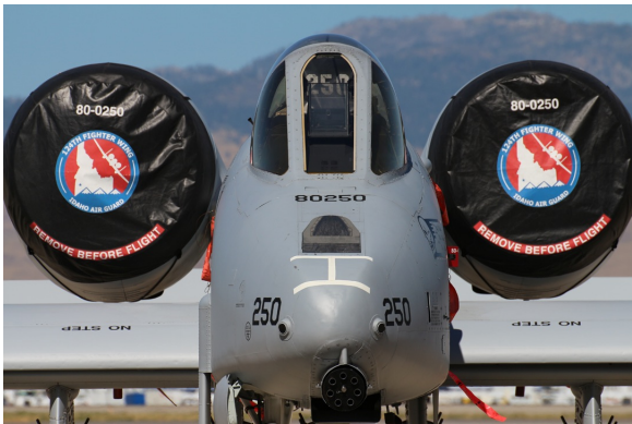
A-10 Engine Covers

ALL-YEAR USE MATERIAL - Made with Solution dyed Polyester fabric, the all-year use material is the best option for sun protection and cover longevity. This heavier more durable material is intended for all weather conditions, such as rain and snow or lots of sun.