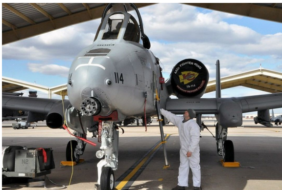
Fairchild A10 Intake Covers & Nose Gun Scoop Plug

ALL-YEAR USE MATERIAL - Made with Solution dyed Polyester fabric, the all-year use material is the best option for sun protection and cover longevity. This heavier more durable material is intended for all weather conditions, such as rain and snow or lots of sun.