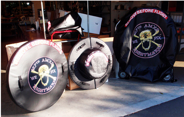
A-10 Engine Intake Plug, Exhaust Plug/Cover, Intake Cover (from left to right)