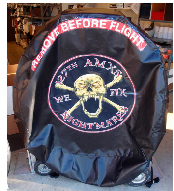
A-10 Engine Intake Cover