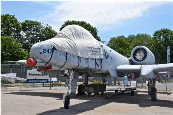
Fairchild A10 Thunderbolt Canopy Cover, Nose Gun Cover, Gun Scoop Inlet Plug

The Engine Inlet Plugs are custom fit for your Fairchild A10 Thunderbolt intakes, made with heavy-duty vinyl material, and stuffed with a single block of sculpted urethane foam. Each plug has a zipper that allows the foam to be removed and dried if necessary. Engine plugs have 'remove before flight' streamers sewn onto the face of the plugs. Most plugs are imprinted with the aircraft registration number in black for an extra charge. Storage bag NOT included. Engine plugs may be inserted after flight when the engine is still warm. Engine Inlet Plugs are commonly referred to as Cowl Plugs, Intake Plugs, Cowl Blocks, Engine Blocks, and Engine Bungs.