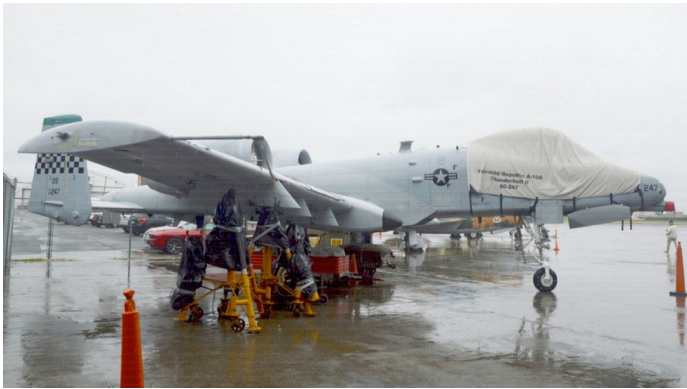
Fairchild A10 Thunderbolt Canopy Cover