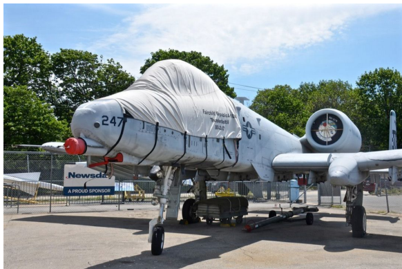
Fairchild A10 Thunderbolt Canopy Cover, Nose Gun Cover, Gun Scoop Inlet Plug

ALL-YEAR USE MATERIAL - Made with Silver Acrylic Sunbrella canvas, the all-year use material is the best option for sun protection and cover longevity. This heavier more durable material is intended for all weather conditions, such as rain and snow or lots of sun.