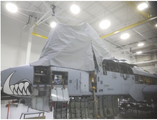
Fairchild A-10 Canopy Cover, open position