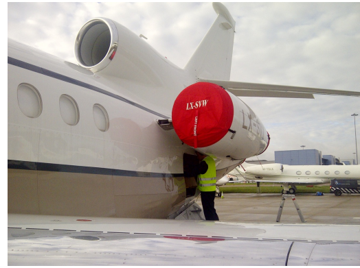
Falcon 900EX Engine Covers