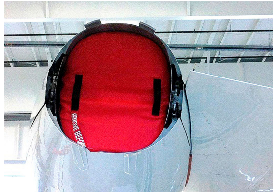
Falcon 2000EX Exhaust Plug