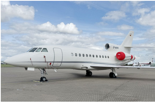
Falcon 900LX Engine Covers