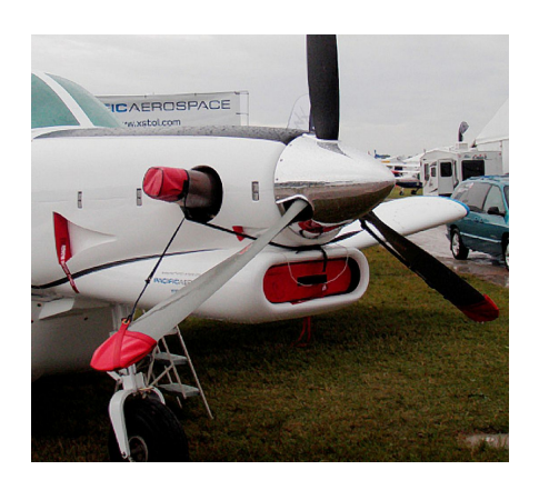
750XL Engine Inlet Plugs & Prop Tie/Exhaust Covers