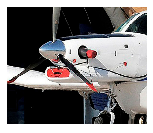
750XL Engine Inlet Plugs & Prop Tie/Exhaust Covers