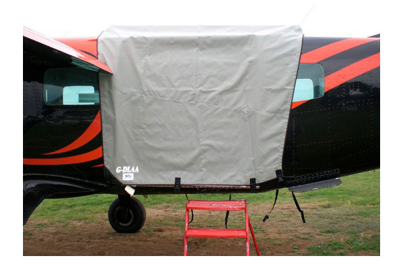
Cessna 208 Caravan Jump Door Cover