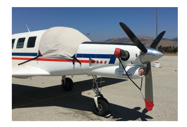
750XL Combination Insulated Engine Cover/Cockpit Cover Pacific Aerospace 750XL Cockpit Cover, Prop Tie/Exhaust Covers