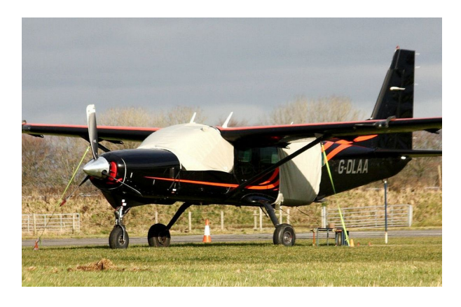
Cessna Caravan Cockpit Cover, Engine Plugs, Jump Door Cover