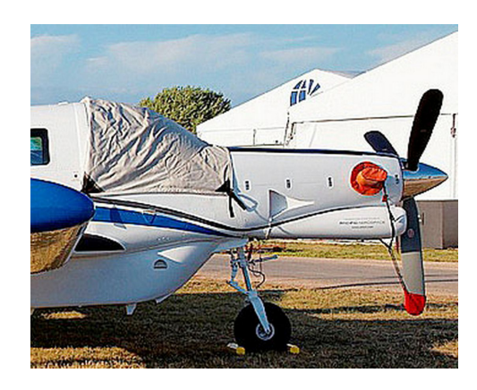
750XL Cockpit Cover & Prop Tie/Exhaust Covers

This cover type is made from Silver Acrylic Sunbrella canvas and is 100% lined with a soft and smooth microfiber. Bruce's Custom Covers developed this material combination especially for aircraft protection. The outer material is medium weight and treated for water resistance, UV resistance and anti-static buildup. The inner lining is a very soft and smooth microfiber to prevent scratching. The material is very reflective, and tests show that the cabin interior temperature can be reduced to near-ambient temperature on the hottest of days. It is water, ice and snow repellent, yet breathable to allow moisture to escape from between the cover and the aircraft surface.