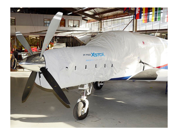
Pacific Aerospace 750XL Cockpit Cover, Prop Tie/Exhaust Covers 750XL Combination Insulated Engine Cover/Cockpit Cover