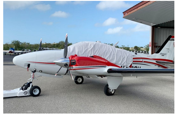
Beech Baron G58 Canopy Cover