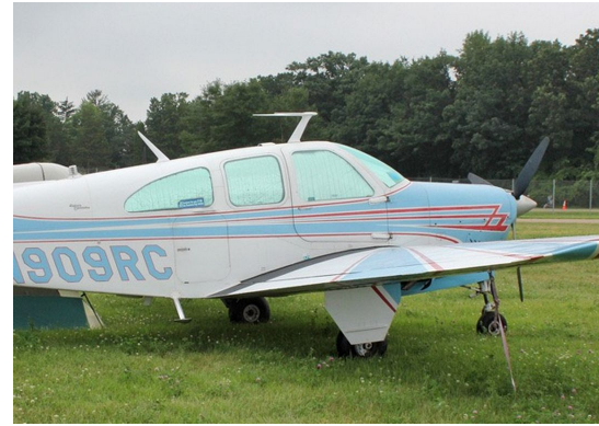
Beech Bonanza/Debonair HeatShield Set