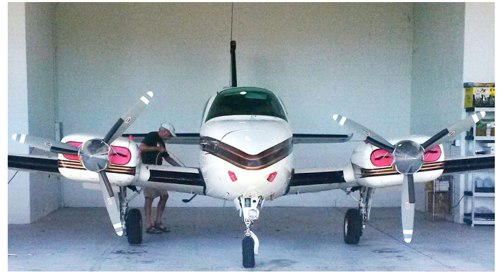
Beech Baron 58 Engine Inlet Plugs, Cowl Top Plugs, Heater Inlet, Pitot Cover