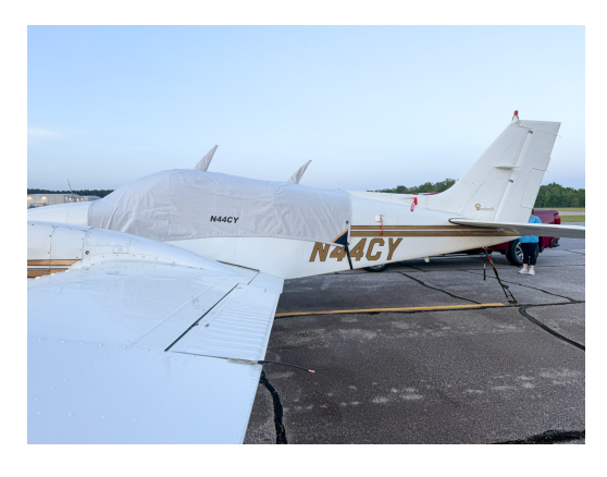
Beech Baron B55 Canopy Cover