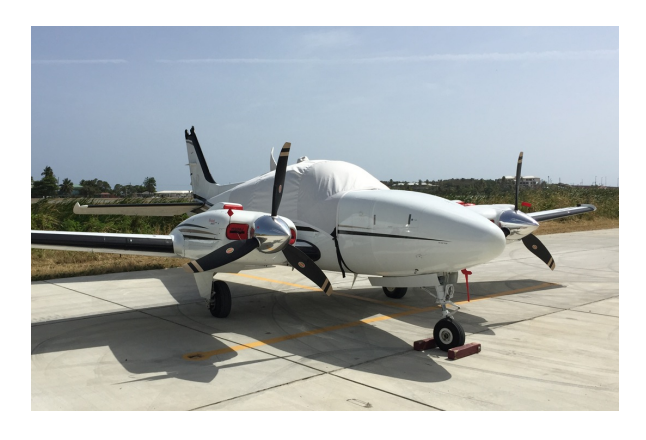
Baron 58 Canopy Cover, Engine Plugs