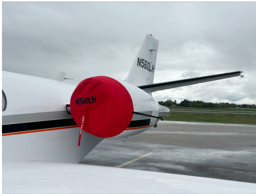
Cessna 560 Intake Covers, includes pylon plugs (set of 4)

The Cessna Citationjet V Encore (560) Intake/Exhaust Plugs are custom fit for the intake and exhaust openings, made with heavy-duty vinyl material, and stuffed with a single block of sculpted urethane foam. Each plug has a zipper that allows the foam to be removed and dried if necessary. Engine plugs have 'remove before flight' streamers sewn onto the face of the plugs. Most plugs are imprinted with the aircraft registration number in black. Engine plugs may be inserted after flight when the engine is still warm. Engine Inlet Plugs are commonly referred to as Cowl Plugs, Intake Plugs, Cowl Blocks, Engine Blocks, and Engine Bungs.