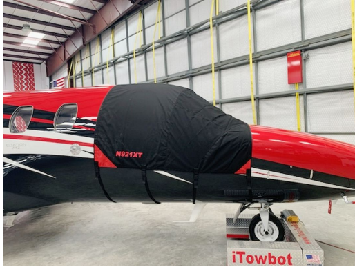
Citationjet 525 Cockpit Cover

This cover type is made from Silver Acrylic Sunbrella canvas and is 100% lined with a soft and smooth microfiber. Bruce's Custom Covers developed this material combination especially for aircraft protection. The outer material is medium weight and treated for water resistance, UV resistance and anti-static buildup. The inner lining is a very soft and smooth microfiber to prevent scratching. The material is very reflective, and tests show that the cabin interior temperature can be reduced to near-ambient temperature on the hottest of days. It is water, ice and snow repellent, yet breathable to allow moisture to escape from between the cover and the aircraft surface.