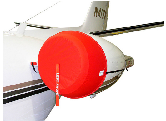
Citation Encore Intake Cover Set