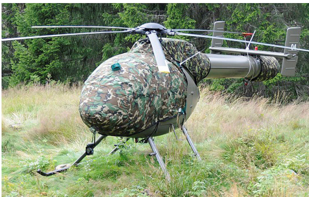
MD520 NOTAR Bubble, Engine, & NOTAR Covers & Blade Tie-downs

The Tailboom Cover details vary by model, but generally the helicopter tail boom cover encloses the tail boom from the "bottleneck" to the aft end. They usually also cover the horizontal stabilizers, and are custom made to allow for antennae, lights, and other protrusions. They attach with straps underneath the tail boom. Covers for the vertical and horizontal stabilizers are also available separately. Specific information for each model is available on request.