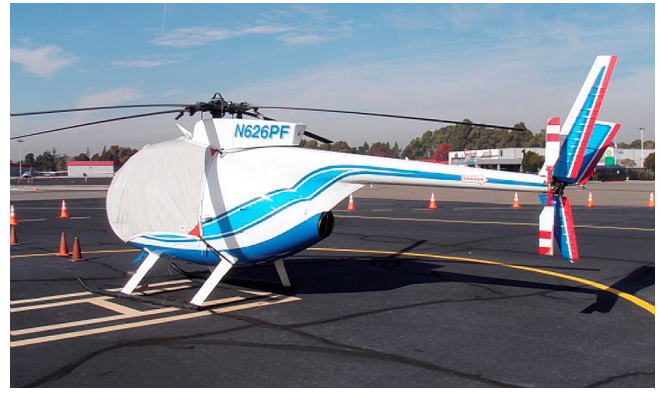
MD500C Bubble Cover with Wire Strike detail