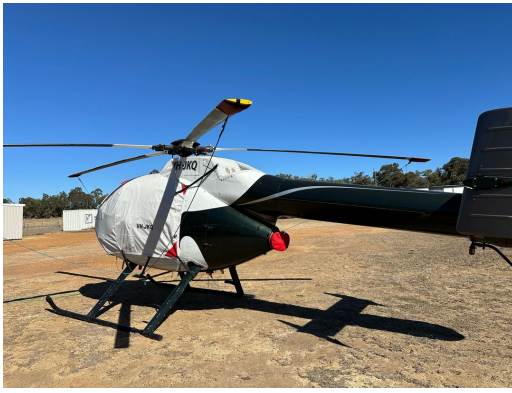
MDD 520 NOTAR Bubble Cover w/Intake Cover Add-On, Exhaust Cover