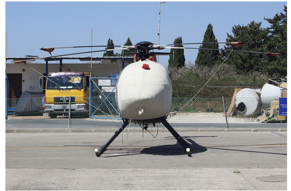
MD-500E Bubble Cover, Blade Tie-Downs