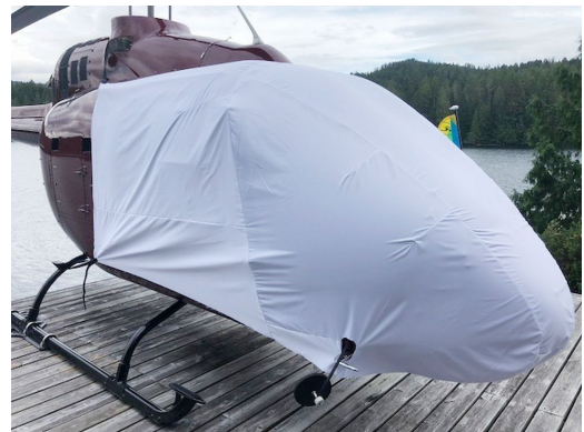
Bell 505 Bubble Cover, test fit cover