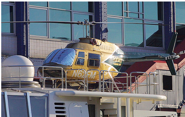
Bell 206B Jet Ranger Windshield HeatShields

Heatshields are interior sunshades for an aircraft's windows or canopy glass. The product is a unique composite of closed-cell foam with a silver mylar finish. The semi-rigid design is stiff enough to stand along the inside of the windshield using sun visors or window framing. It folds up flat and easily stores in the included storage sleeve. Some designs may require velcro and suction cups. A Heatshield is an excellent short-term remedy for cockpit overheating.