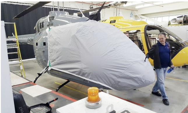
Bell 505 Bubble Cover

Travel Covers are made with Silver Solution-Dyed Polyester fabric and fully lined over the entire cover. The material is lightweight and more compact for easy storage in the aircraft. The polyester material is water resistant, but only intended for occasional use outside. We also have an ultra lightweight material available for fitted hangar dust covers. For daily outdoor use, the non-travel Sunbrella Cover is the best choice.