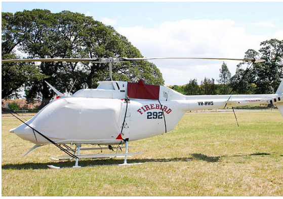
206B Bubble Cover