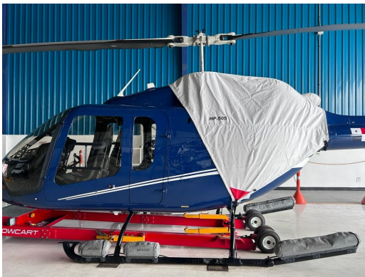
Bell 505 Engine Cover

WINTER USE MATERIAL - Made with Solution-Dyed Polyester fabric, this option is intended for seasonal use to aid in deicing, rain mitigation, or for occasional travel. The material is lighter and more compact, but more susceptible to UV damage and may have a shorter useful life if used continuously outside than the all-year use material.