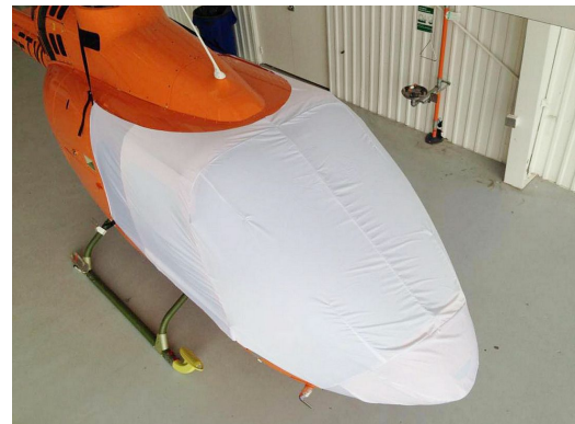
Bell 505 Bubble Cover, test fit cover.