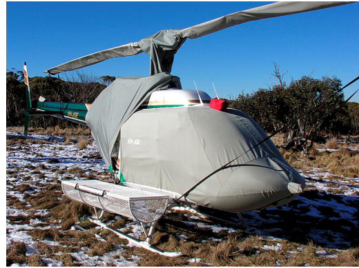
JetRanger Bubble, Engine, Rotor Hub & Blade Covers (& Tie-Downs)