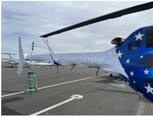
Bell 505 Tailboom & Stabilizer Covers, test fit cover