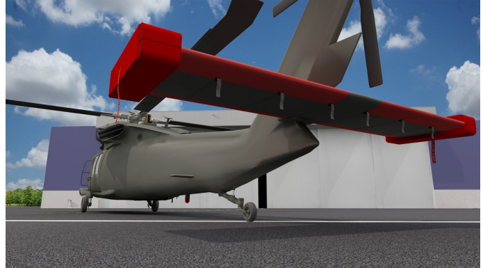
Padded Horizontal Stab Covers, Wingtip Pads (illustration)