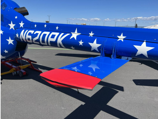
Bell 505 Horizontal Stabilizer Tip Pads

Designed to prevent damage to the aircraft extremities in crowded hangars, these products are made of bright red Naugahyde and thickly padded with a sandwich of closed cell foam.