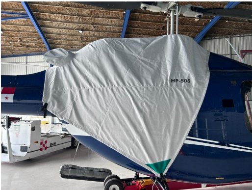
Bell 505 Engine Cover