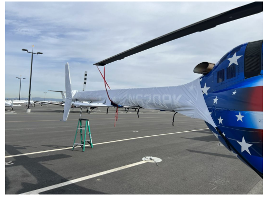
Bell 505 Tailboom & Stabilizer Covers, test fit cover