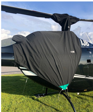
Bell 505 Engine, Rotor Mast & Blade Covers

WINTER USE MATERIAL - Made with Solution-Dyed Polyester fabric, this option is intended for seasonal use to aid in deicing, rain mitigation, or for occasional travel. The material is lighter and more compact, but more susceptible to UV damage and may have a shorter useful life if used continuously outside than the all-year use material.