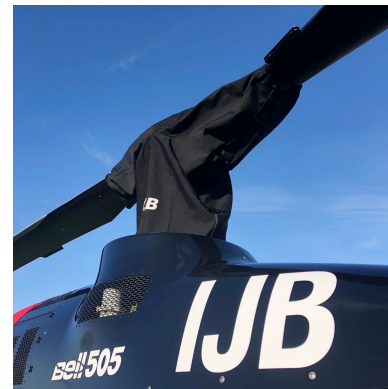
Bell 505 Rotor Mast & Blade Covers