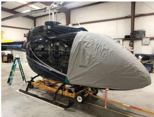
Bell 505 Light Weight Travel Bubble Cover

Travel Covers are made with Silver Solution-Dyed Polyester fabric and fully lined over the entire cover. The material is lightweight and more compact for easy storage in the aircraft. The polyester material is water resistant, but only intended for occasional use outside. We also have an ultra lightweight material available for fitted hangar dust covers. For daily outdoor use, the non-travel Sunbrella Cover is the best choice.