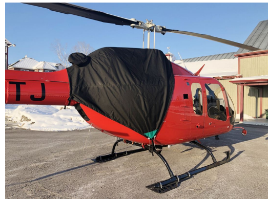
Bell 505 Engine Cover