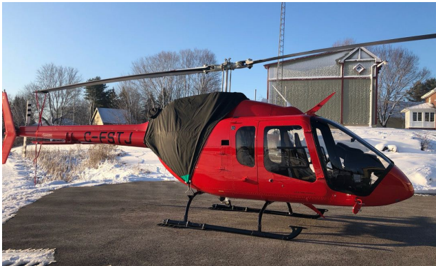
Bell 505 Engine Cover

WINTER USE MATERIAL - Made with Solution-Dyed Polyester fabric, this option is intended for seasonal use to aid in deicing, rain mitigation, or for occasional travel. The material is lighter and more compact, but more susceptible to UV damage and may have a shorter useful life if used continuously outside than the all-year use material.