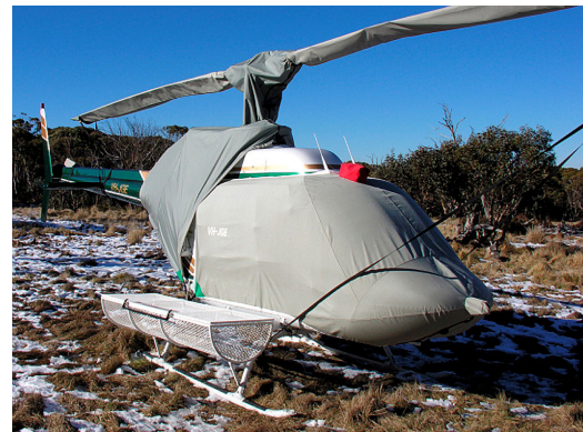
JetRanger Bubble, Engine, Rotor Hub & Blade Covers (& Tie-Downs)