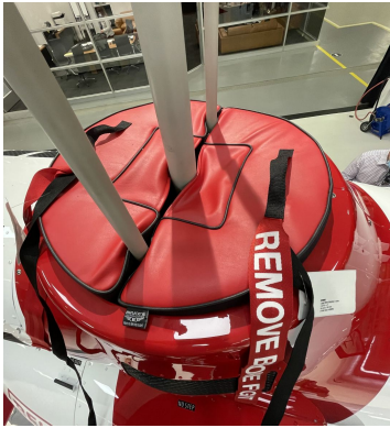
Bell 505 Swash Plate Plug

The Engine Inlet Plugs are custom fit for your Bell 505 Jet Ranger X intakes, made with heavy-duty vinyl material, and stuffed with a single block of sculpted urethane foam. Each plug has a zipper that allows the foam to be removed and dried if necessary. Engine plugs have 'Remove Before Flight' streamers sewn onto the face of the plugs. Most plugs are imprinted with the aircraft registration number in black for an extra charge. Storage bag NOT included. Engine plugs may be inserted after flight when the engine is still warm. Engine Inlet Plugs are commonly referred to as Cowl Plugs, Intake Plugs, Cowl Blocks, Engine Blocks, and Engine Bungs.