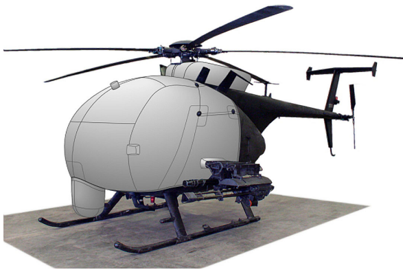
MH-6J Bubble, Flir & Doghouse Covers (illustration)