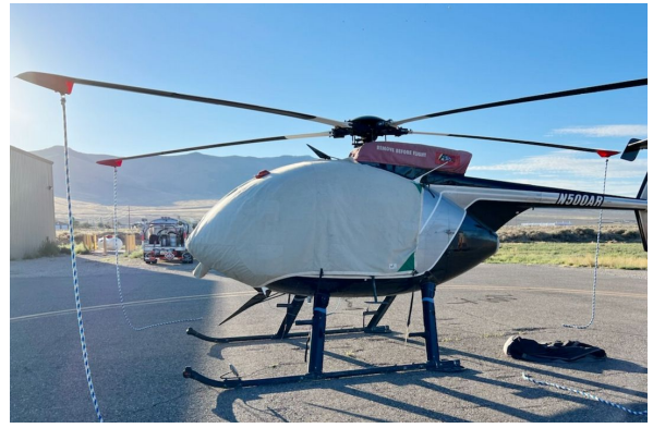
MD 500E Bubble Cover