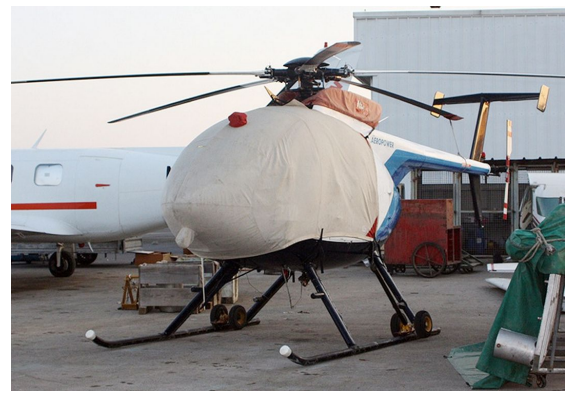
MD-500E Bubble Cover