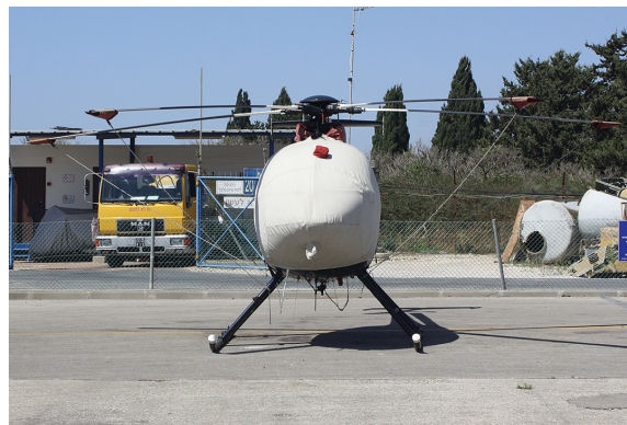
MD-500E Bubble Cover, Blade Tie-Downs