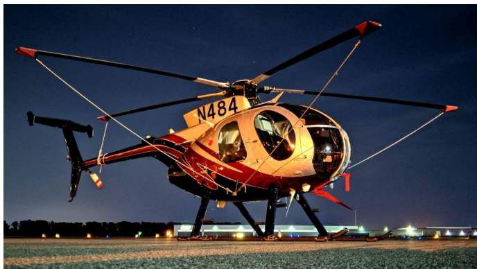
Hughes 500D Blade Tie-Downs

WINTER USE MATERIAL - Made with Solution-Dyed Polyester fabric, this option is intended for seasonal use to aid in deicing, rain mitigation, or for occasional travel. The material is lighter and more compact, but more susceptible to UV damage and may have a shorter useful life if used continuously outside than the all-year use material.