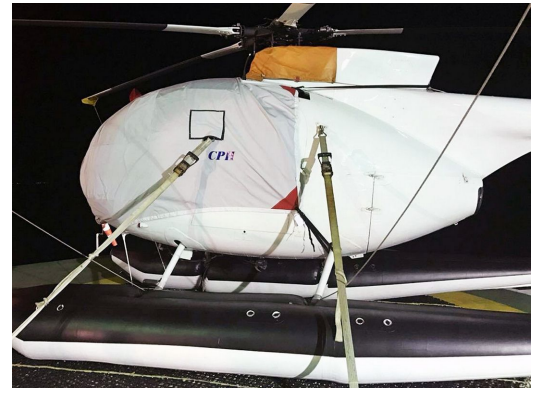
Customized with tie-down access flaps