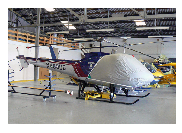
Enstrom 480 Bubble Cover