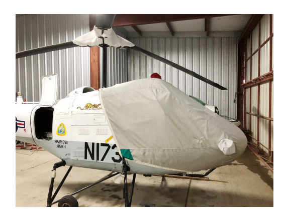
Enstrom F28A, F28C Bubble Cover "Flat Nose"

WINTER USE MATERIAL - Made with Solution-Dyed Polyester fabric, this option is intended for seasonal use to aid in deicing, rain mitigation, or for occasional travel. The material is lighter and more compact, but more susceptible to UV damage and may have a shorter useful life if used continuously outside than the all-year use material.