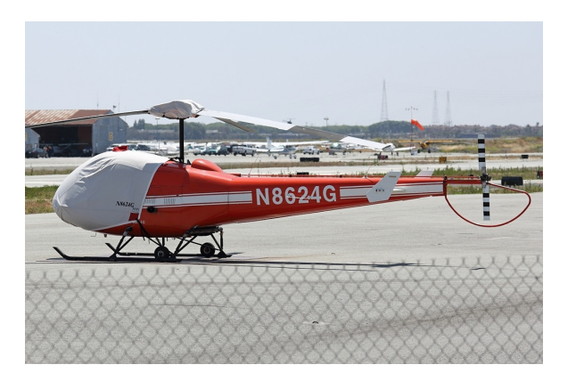
Enstrom F28F Bubble Cover