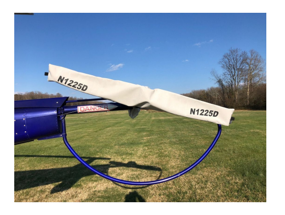
Enstrom F280FX Tail Rotor Cover