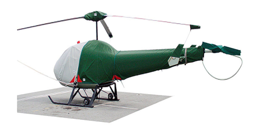
Enstrom 280FX Bubble, Engine, Tailboom, Main & Tail Rotor Covers