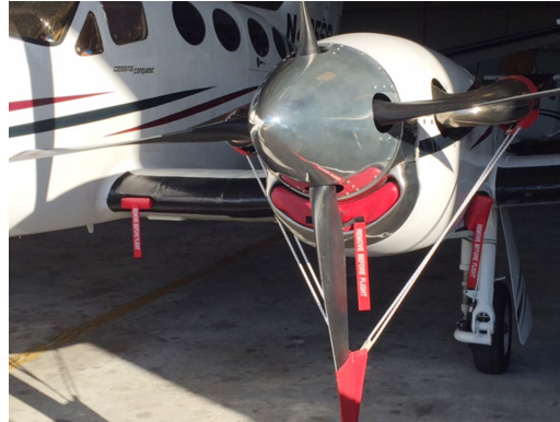
Cessna Conquest I Prop Tie/Exhaust Covers, Engine Plugs