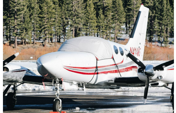
Cessna 414 Cockpit Cover