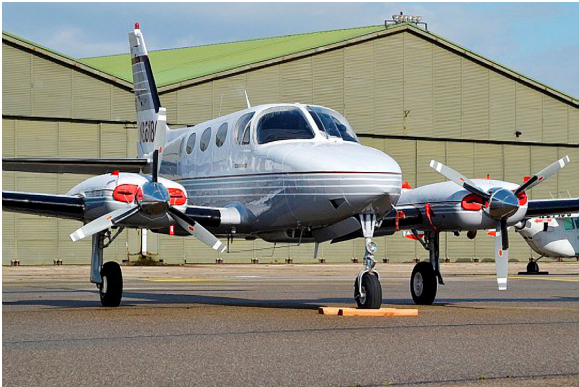
Cessna 340 Engine Plugs

Engine Inlet Plugs are custom fit for your Cessna 441, Conquest II intakes, made with heavy-duty vinyl material, and stuffed with a single block of sculpted urethane foam. Each plug has a zipper that allows the foam to be removed and dried if necessary. Engine plugs have warning flags that are visible from the cockpit or 'remove before flight' streamers sewn onto the face of the plugs. Most plugs are imprinted with the aircraft registration number in black for an extra charge. Storage bag NOT included. Engine plugs may be inserted after flight when the engine is still warm. Engine Inlet Plugs are commonly referred to as Cowl Plugs, Intake Plugs, Cowl Blocks, Engine Blocks, and Engine Bungs.