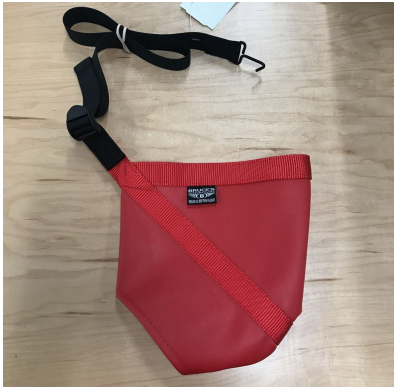
Prop Tie-Down, Various Models (secures with a hook to engine nacelle)