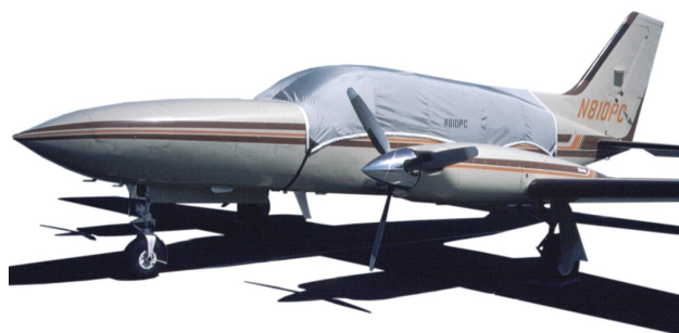
Cessna 421 Cockpit/Windshield Cover