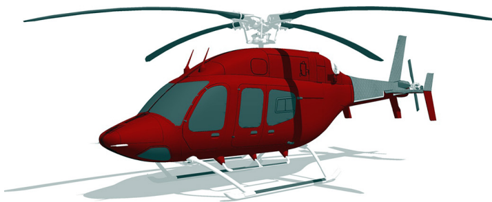
Bell 429 Insulated Tailboom Cover

The Tailboom Cover details vary by model, but generally the helicopter tail boom cover encloses the tail boom from the "bottleneck" to the aft end. They usually also cover the horizontal stabilizers, and are custom made to allow for antennae, lights, and other protrusions. They attach with straps underneath the tail boom. Covers for the vertical and horizontal stabilizers are also available separately. Specific information for each model is available on request.