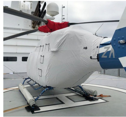
Bell 429 Main Body Cover, Rotor Hub & Tail Rotor Covers