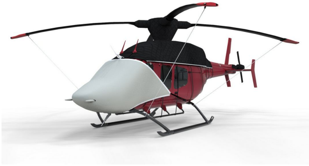
Bell 429 Cockpit/Nose Cover, Engine Cover, etc.