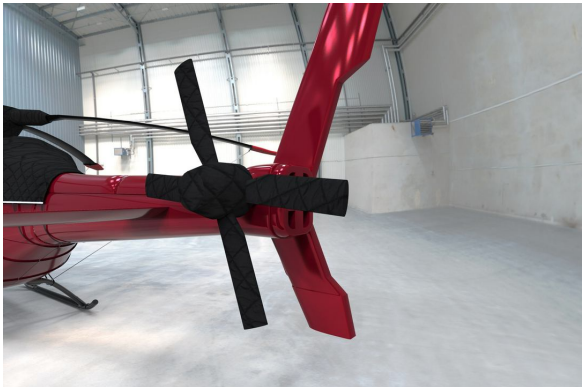
Bell 429 Tail Rotor Cover