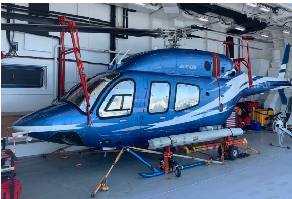
Bell 429 Cockpit & Cabin HeatShields

Cockpit Heatshields are interior sunshades for the aircraft's cockpit. The product is a unique composite of closed-cell foam with a silver mylar finish. The semi-rigid design is stiff enough to stand inside the window framing. Darts and folds are incorporated into the material so that it conforms to the complex shape of the helicopter windows. The set folds up flat and is easily stored in the included storage sleeve. Some designs may require velcro and suction cups. A Heatshield is an excellent short-term remedy for cockpit overheating, but an external fabric cover is more effective for long-term protection.