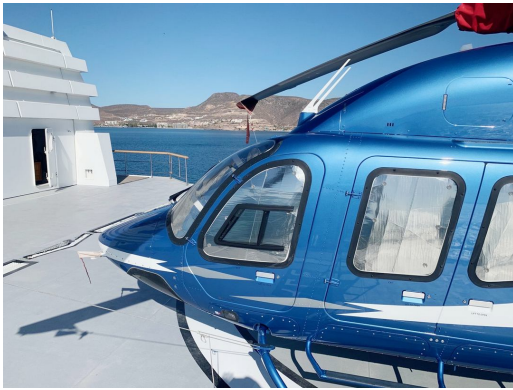
Bell 429 Cockpit & Cabin HeatShields

Cockpit Heatshields are interior sunshades for the aircraft's cockpit. The product is a unique composite of closed-cell foam with a silver mylar finish. The semi-rigid design is stiff enough to stand inside the window framing. Darts and folds are incorporated into the material so that it conforms to the complex shape of the helicopter windows. The set folds up flat and is easily stored in the included storage sleeve. Some designs may require velcro and suction cups. A Heatshield is an excellent short-term remedy for cockpit overheating, but an external fabric cover is more effective for long-term protection.