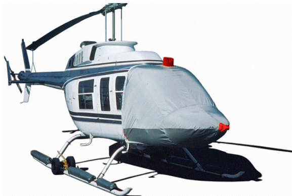
Cockpit Cover on Bell 206L

Travel Covers are made with Silver Solution-Dyed Polyester fabric and fully lined over the entire cover. The material is lightweight and more compact for easy stowage in the aircraft. The polyester material is water resistant, but only intended for occasional use outside. We also have an ultra lightweight material available for fitted hangar dust covers. For daily outdoor use, the non-travel Sunbrella Cover is the best choice.