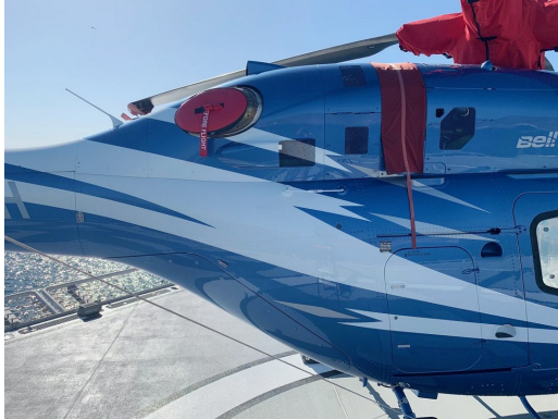
Bell 429 Exhaust Plug, Rotor Mast Cover

The Engine Exhaust Plugs are custom fit for your Bell 429 exhaust openings, made with heavy-duty vinyl material, and stuffed with a single block of sculpted urethane foam. Exhaust plugs have 'Remove Before Flight' streamers sewn onto the face of the plugs. Exhaust plugs may be inserted soon after flight when the engine is still warm. Engine Inlet Plugs are commonly referred to as Cowl Plugs, Intake Plugs, Cowl Blocks, Engine Blocks, and Engine Bungs.