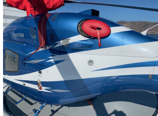
Bell 429 Exhaust Plug