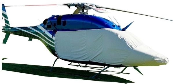
Bell 429 Bubble Cover