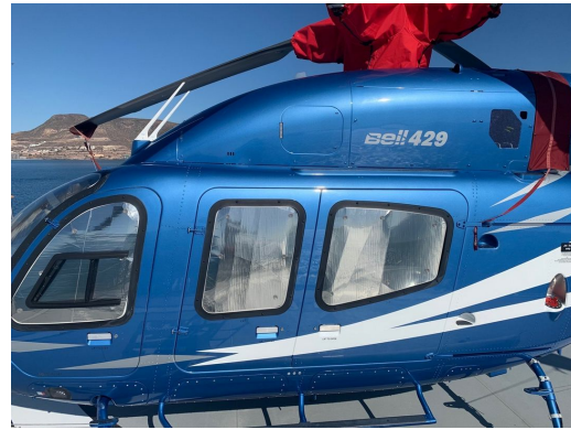
Bell 429 Cockpit & Cabin HeatShields, Rotor Mast/Drive Shafts Cover