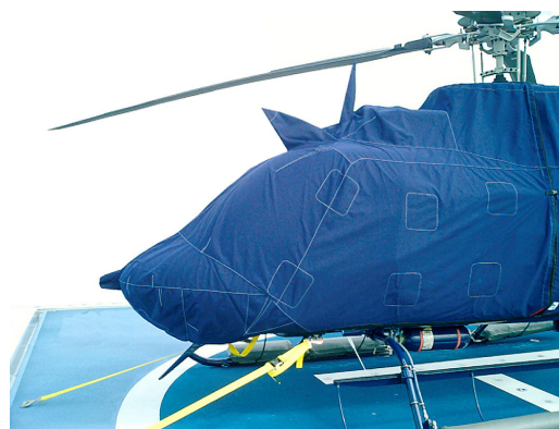
206B/206L/407 Full Body Cover