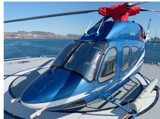
Bell 429 Cockpit & Cabin HeatShields, Rotor Mast/Drive Shafts Cover