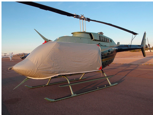
Bell 206L Longranger Bubble Cover

Travel Covers are made with Silver Solution-Dyed Polyester fabric and fully lined over the entire cover. The material is lightweight and more compact for easy storage in the aircraft. The polyester material is water resistant, but only intended for occasional use outside. We also have an ultra lightweight material available for fitted hangar dust covers. For daily outdoor use, the non-travel Sunbrella Cover is the best choice.