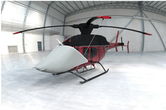
Bell 429 Cockpit/Nose Cover, Engine Cover, etc.

WINTER USE MATERIAL - Made with Solution-Dyed Polyester fabric, this option is intended for seasonal use to aid in deicing, rain mitigation, or for occasional travel. The material is lighter and more compact, but more susceptible to UV damage and may have a shorter useful life if used continuously outside than the all-year use material.