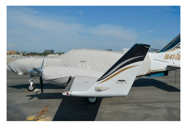
Cessna 414 Extended Canopy/Nose Cover, Engine Covers