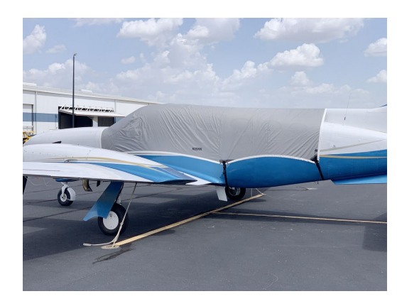
Cessna 414 Travel Weight Canopy Cover

Travel Covers are made with Silver Solution-Dyed Polyester fabric and only lined over the windshield to save weight. The material is lightweight and more compact for easy stowage in the aircraft. The polyester material is water resistant, but only intended for occasional use outside. We also have an ultra lightweight material available for fitted hangar dust covers. For daily outdoor use, the non-travel Sunbrella Cover is the best choice.