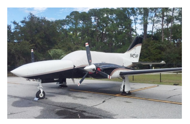
Cessna 421 Canopy Cover, Engine Plugs

Covers developed this material combination especially for aircraft protection. The outer material is medium weight and treated for water resistance, UV resistance and anti-static buildup. The inner lining is a very soft and smooth microfiber to prevent scratching. The material is very reflective, and tests show that the cabin interior temperature can be reduced to near-ambient temperature on the hottest of days. It is water, ice and snow repellent, yet breathable to allow moisture to escape from between the cover and the aircraft surface.