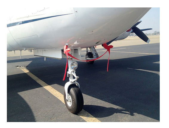
Cessna 421 Pltot Covers set

single block of sculpted urethane foam. Each plug has a zipper that allows the foam to be removed and dried if necessary. Engine plugs have warning flags that are visible from the cockpit or 'remove before flight' streamers sewn onto the face of the plugs. Most plugs are imprinted with the aircraft registration number in black for an extra charge. Storage bag NOT included. Engine plugs may be inserted after flight when the engine is still warm. Engine Inlet Plugs are commonly referred to as Cowl Plugs, Intake Plugs, Cowl Blocks, Engine Blocks, and Engine Bungs.