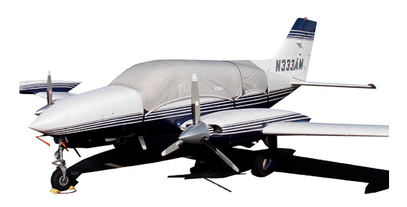
Cessna 414 Canopy Cover & Pitot Covers