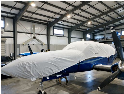
Cessna 421B Canopy/Nose Cover

This cover type is made from Silver Acrylic Sunbrella canvas and is 100% lined with a soft and smooth microfiber. Bruce's Custom Covers developed this material combination especially for aircraft protection. The outer material is medium weight and treated for water resistance, UV resistance and anti-static buildup. The inner lining is a very soft and smooth microfiber to prevent scratching. The material is very reflective, and tests show that the cabin interior temperature can be reduced to near-ambient temperature on the hottest of days. It is water, ice and snow repellent, yet breathable to allow moisture to escape from between the cover and the aircraft surface.