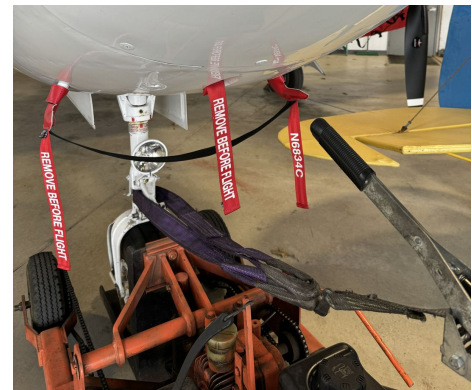
Cessna 421C Pitot Covers, Nose Inlet Plug