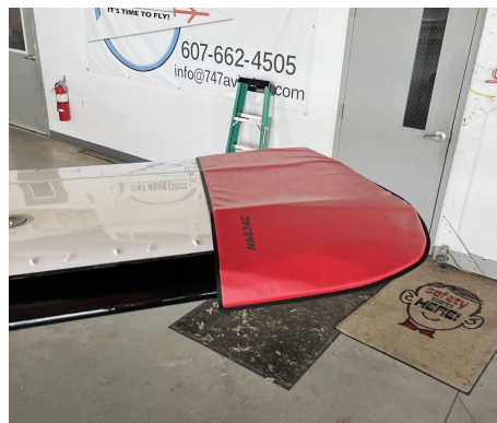
Cessna 421C Wingtip Pads