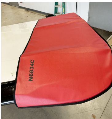
Cessna 421C Wingtip Pads

Designed to prevent damage to the aircraft extremities in crowded hangars, these products are made of bright red Naugahyde and thickly padded with a sandwich of closed cell foam. Nowadays they are also made using bright red Neoprene padded laminated (think: wetsuit material).