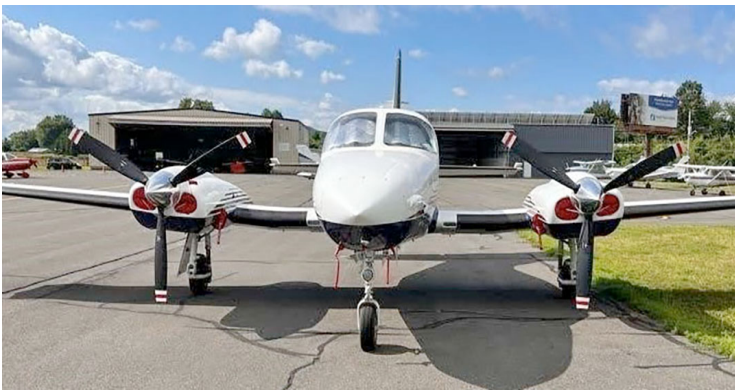
Cessna 421 Engine Plugs

Engine Inlet Plugs are custom fit for your Cessna 421 intakes, made with heavy-duty vinyl material, and stuffed with a single block of sculpted urethane foam. Each plug has a zipper that allows the foam to be removed and dried if necessary. Engine plugs have warning flags that are visible from the cockpit or 'remove before flight' streamers sewn onto the face of the plugs. Most plugs are imprinted with the aircraft registration number in black for an extra charge. Storage bag NOT included. Engine plugs may be inserted after flight when the engine is still warm. Engine Inlet Plugs are commonly referred to as Cowl Plugs, Intake Plugs, Cowl Blocks, Engine Blocks, and Engine Bungs.