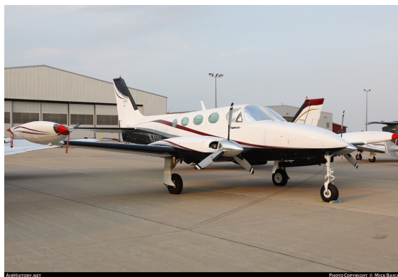
Cessna 340 Wingtip Pads