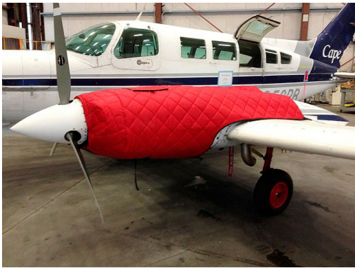
Cessna 402 Insulated Engine Cover

This cover type is made from Silver Acrylic Sunbrella canvas and is 100% lined with a soft and smooth microfiber. Bruce's Custom Covers developed this material combination especially for aircraft protection. The outer material is medium weight and treated for water resistance, UV resistance and anti-static buildup. The inner lining is a very soft and smooth microfiber to prevent scratching. The material is very reflective, and tests show that the cabin interior temperature can be reduced to near-ambient temperature on the hottest of days. It is water, ice and snow repellent, yet breathable to allow moisture to escape from between the cover and the aircraft surface.