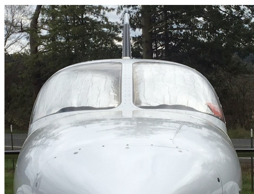
Cessna 421 Windshield HeatShields