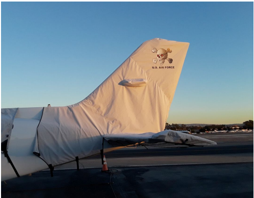
Cessna 421 Empennage Cover

WINTER USE MATERIAL - Made with Solution-Dyed Polyester fabric, this option is intended for seasonal use to aid in deicing, rain mitigation, or for occasional travel. The material is lighter and more compact, but more susceptible to UV damage and may have a shorter useful life if used continuously outside than the all-year use material.