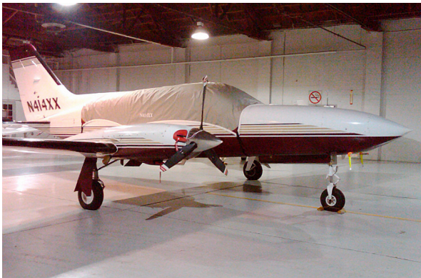
Cessna 414 Canopy Cover and Engine Inlet Plugs