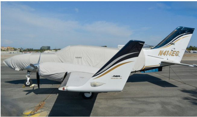
Cessna 414A Extended Canopy/Nose Cover & Engine Covers