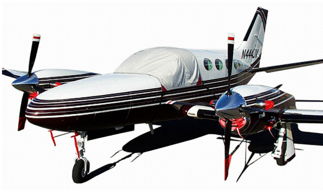
Cessna 425 Cockpit Cover