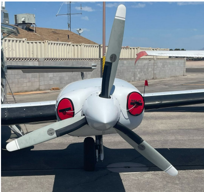
Cessna 414 Engine Inlet Plugs

Engine Inlet Plugs are custom fit for your Cessna 414, 414A intakes, made with heavy-duty vinyl material, and stuffed with a single block of sculpted urethane foam. Each plug has a zipper that allows the foam to be removed and dried if necessary. Engine plugs have warning flags that are visible from the cockpit or 'remove before flight' streamers sewn onto the face of the plugs. Most plugs are imprinted with the aircraft registration number in black for an extra charge. Storage bag NOT included. Engine plugs may be inserted after flight when the engine is still warm. Engine Inlet Plugs are commonly referred to as Cowl Plugs, Intake Plugs, Cowl Blocks, Engine Blocks, and Engine Bungs.