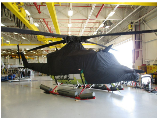
Bell 412 Cockpit/Canopy/Nose, Insulated Engine Area, Rotor Hub, Blade, Tailboom and Tail Rotor Covers

The Tailboom Cover details vary by model, but generally the helicopter tail boom cover encloses the tail boom from the "bottleneck" to the aft end. They usually also cover the horizontal stabilizers, and are custom made to allow for antennae, lights, and other protrusions. They attach with straps underneath the tail boom. Covers for the vertical and horizontal stabilizers are also available separately. Specific information for each model is available on request.