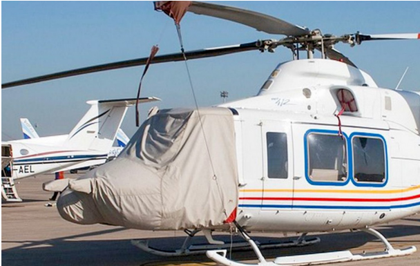
Bell 412 Cockpit/Canopy/Nose Cover, w/Radome