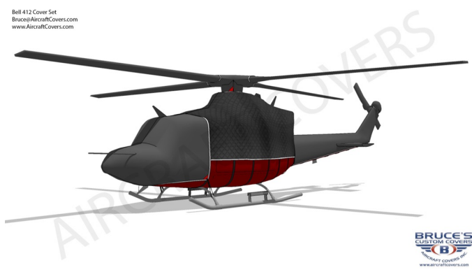
Bell 412 Forward Cabin/Nose, Insulated Engine, Tailboom, Rotor Hub & Blade Covers