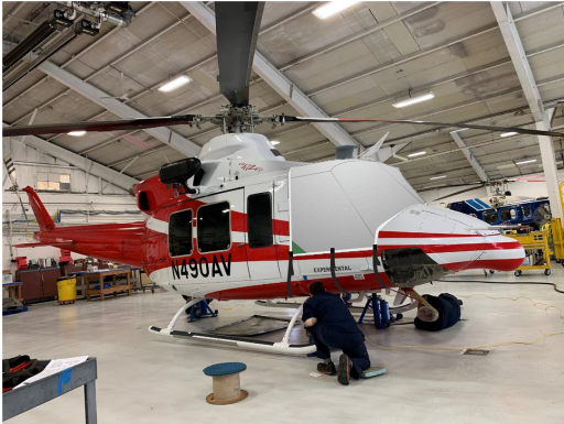
Bell 412 Cockpit/Canopy Cover, photo/illustration

Travel Covers are made with Silver Solution-Dyed Polyester fabric and fully lined over the entire cover. The material is lightweight and more compact for easy stowage in the aircraft. The polyester material is water resistant, but only intended for occasional use outside. We also have an ultra lightweight material available for fitted hangar dust covers. For daily outdoor use, the non-travel Sunbrella Cover is the best choice.