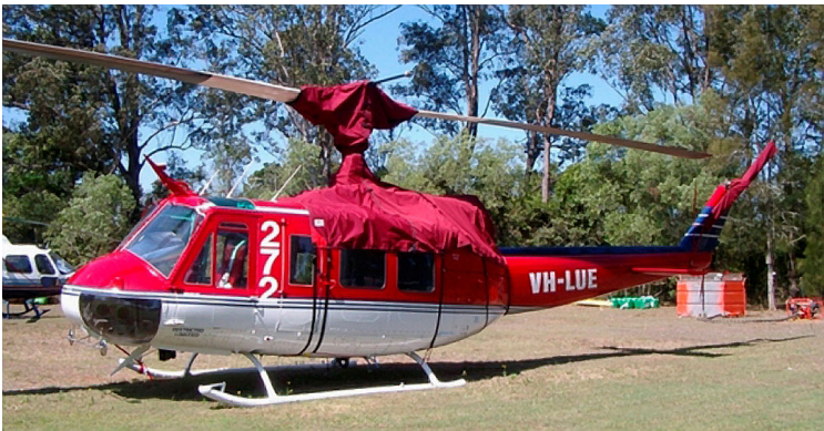
Bell 412 Cockpit/Canopy/Nose, Insulated Engine Area, Rotor Hub, Blade, Tailboom and Tail Rotor Covers