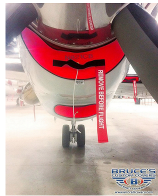
Engine and Oil Cooler Inlet Plugs