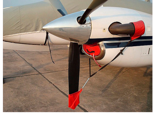
Prop Tie-down/Exhaust Covers