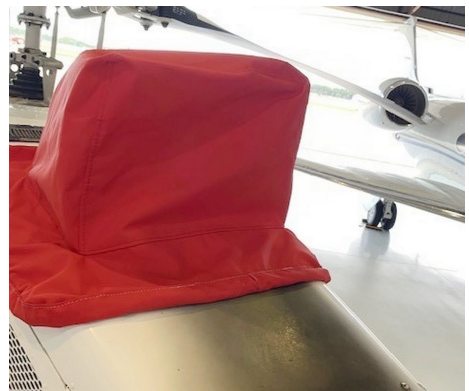
Bell 407 Exhaust/Gap Cover (weighted)