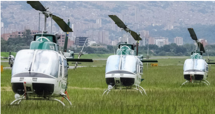
Bell 407 Windshield Heatshields

Heatshields are interior sunshades for an aircraft's windows or canopy glass. The product is a unique composite of closed-cell foam with a silver mylar finish. The semi-rigid design is stiff enough to stand along the inside of the windshield using sun visors or window framing. It folds up flat and easily stores in the included storage sleeve. Some designs may require velcro and suction cups. A Heatshield is an excellent short-term remedy for cockpit overheating.