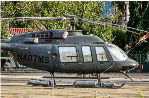
Bell 407 Cockpit & Cabin HeatShields