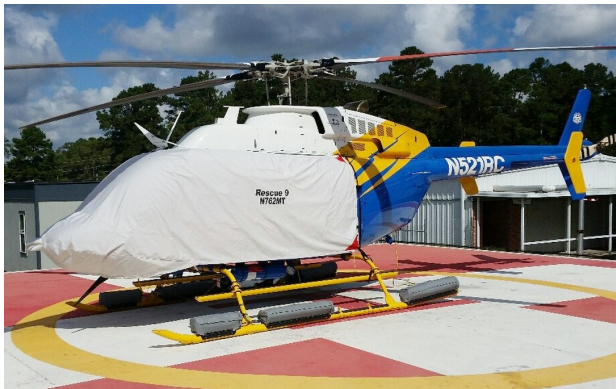
Bell 407 Bubble Cover, with Wire Strike option

Travel Covers are made with Silver Solution-Dyed Polyester fabric and fully lined over the entire cover. The material is lightweight and more compact for easy stowage in the aircraft. The polyester material is water resistant, but only intended for occasional use outside. We also have an ultra lightweight material available for fitted hangar dust covers. For daily outdoor use, the non-travel Sunbrella Cover is the best choice.