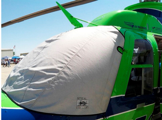
Bell 407 Windshield Cover

This cover type is made from Silver Acrylic Sunbrella canvas and is 100% lined with a soft and smooth microfiber. Bruce's Custom Covers developed this material combination especially for aircraft protection. The outer material is medium weight and treated for water resistance, UV resistance and anti-static buildup. The inner lining is a very soft and smooth microfiber to prevent scratching. The material is very reflective, and tests show that the cabin interior temperature can be reduced to near-ambient temperature on the hottest of days. It is water, ice and snow repellent, yet breathable to allow moisture to escape from between the cover and the aircraft surface.