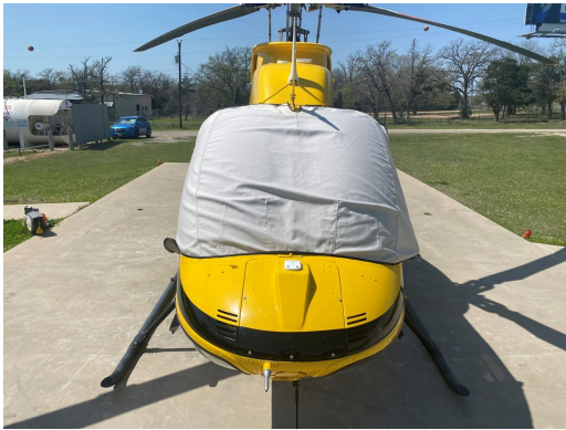
Bell 407 Windshield Cover

Travel Covers are made with Silver Solution-Dyed Polyester fabric and fully lined over the entire cover. The material is lightweight and more compact for easy stowage in the aircraft. The polyester material is water resistant, but only intended for occasional use outside. We also have an ultra lightweight material available for fitted hangar dust covers. For daily outdoor use, the non-travel Sunbrella Cover is the best choice.