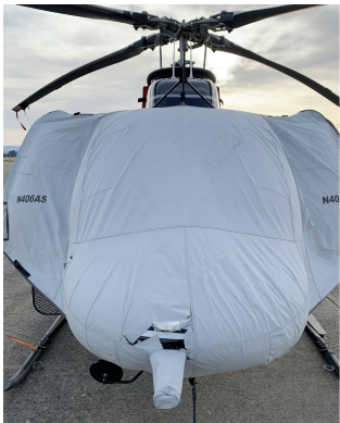
Bell 407 Travel Cover, Abbreviated Bubble Cover, Secures To Doors

This cover type is made from Silver Acrylic Sunbrella canvas and is 100% lined with a soft and smooth microfiber. Bruce's Custom Covers developed this material combination especially for aircraft protection. The outer material is medium weight and treated for water resistance, UV resistance and anti-static buildup. The inner lining is a very soft and smooth microfiber to prevent scratching. The material is very reflective, and tests show that the cabin interior temperature can be reduced to near-ambient temperature on the hottest of days. It is water, ice and snow repellent, yet breathable to allow moisture to escape from between the cover and the aircraft surface.