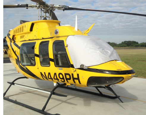
Bell 407 Windshield Cover