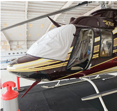
Bell 407 Windshield Cover, pinches into door jambs