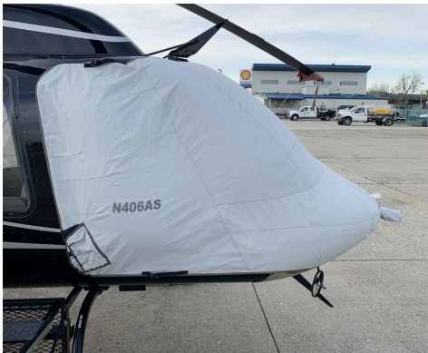
Bell 407 Travel Cover, Abbreviated Bubble Cover, Secures To Doors