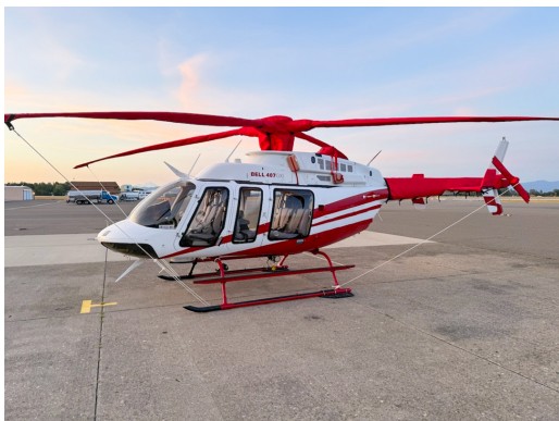
Bell 407 Blade Covers (Cold Weather Type & Tie-Down Add-On)

The Tailboom Cover details vary by model, but generally the helicopter tail boom cover encloses the tail boom from the "bottleneck" to the aft end. They usually also cover the horizontal stabilizers, and are custom made to allow for antennae, lights, and other protrusions. They attach with straps underneath the tail boom. Covers for the vertical and horizontal stabilizers are also available separately. Specific information for each model is available on request.