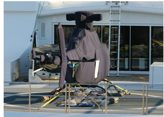
Bell 407 Complete Cover Set