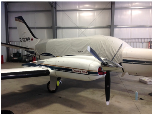
Cessna 404 Canopy Cover, Engine Plugs

This cover type is made from Silver Acrylic Sunbrella canvas and is 100% lined with a soft and smooth microfiber. Bruce's Custom Covers developed this material combination especially for aircraft protection. The outer material is medium weight and treated for water resistance, UV resistance and anti-static buildup. The inner lining is a very soft and smooth microfiber to prevent scratching. The material is very reflective, and tests show that the cabin interior temperature can be reduced to near-ambient temperature on the hottest of days. It is water, ice and snow repellent, yet breathable to allow moisture to escape from between the cover and the aircraft surface.