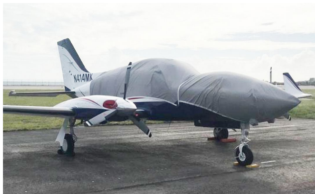
Cessna 414 Travel Cover, Light Weight Canopy Cover