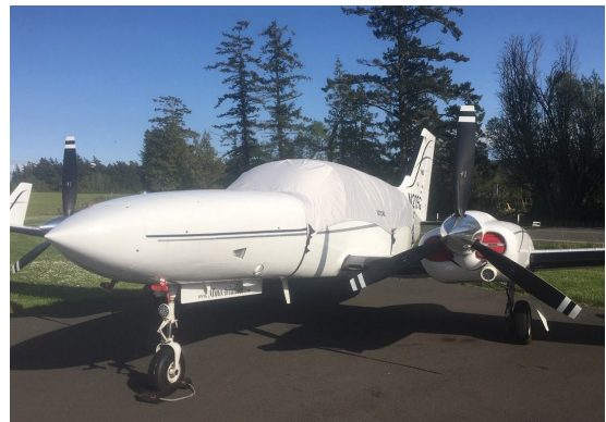
Cessna 421C Canopy Cover