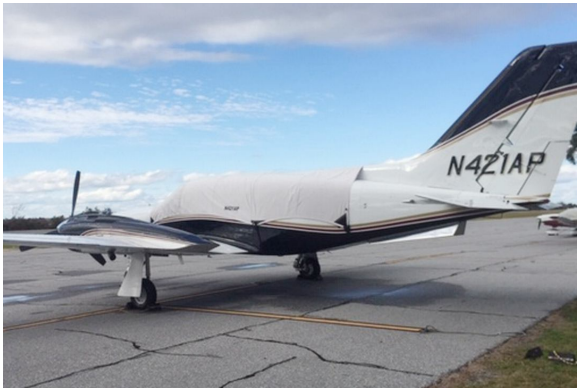
Cessna 421 Canopy Cover

The Cessna 402 Nose Cover is designed to cover the section of the fuselage forward of the windshield to the tip of the nose. It is secured with belly strapsThis cover type is made from Silver Acrylic Sunbrella canvas and is 100% lined with a soft and smooth microfiber. Bruce's Custom Covers developed this material combination especially for aircraft protection. The outer material is medium weight and treated for water resistance, UV resistance and anti-static buildup. The inner lining is a very soft and smooth microfiber to prevent scratching. The material is very reflective, and tests show that the cabin interior temperature can be reduced to near-ambient temperature on the hottest of days. It is water, ice and snow repellent, yet breathable to allow moisture to escape from between the cover and the aircraft surface.