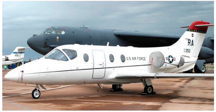
T-1A Jayhawk (Beechjet) Engine & Pitot Cover set