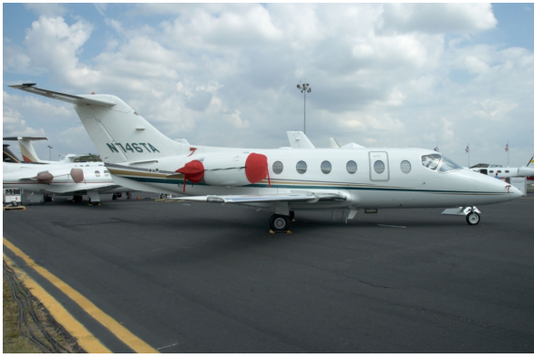
Beechjet 400 Engine Covers