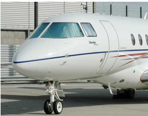
Hawker Beechcraft 4000 Horizon Cockpit Heatshields

Cockpit Heatshields are interior sunshades for the aircraft's cockpit. The product is a unique composite of closed-cell foam with a silver mylar finish. The semi-rigid design is stiff enough to stand inside the window framing. The set folds up flat and is easily stored in the included storage sleeve. Some designs may require velcro and suction cups. Our Heatshields for jets are offered white side out because some aircraft manufacturers have issued advisories against reflective window inserts due to potential heat damage. A Heatshield is an excellent short-term remedy for cockpit overheating, but an external fabric cover is more effective for long-term protection.