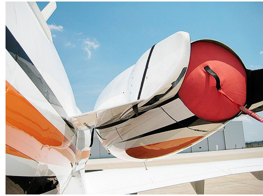
Hawker 4000 Exhaust Plug