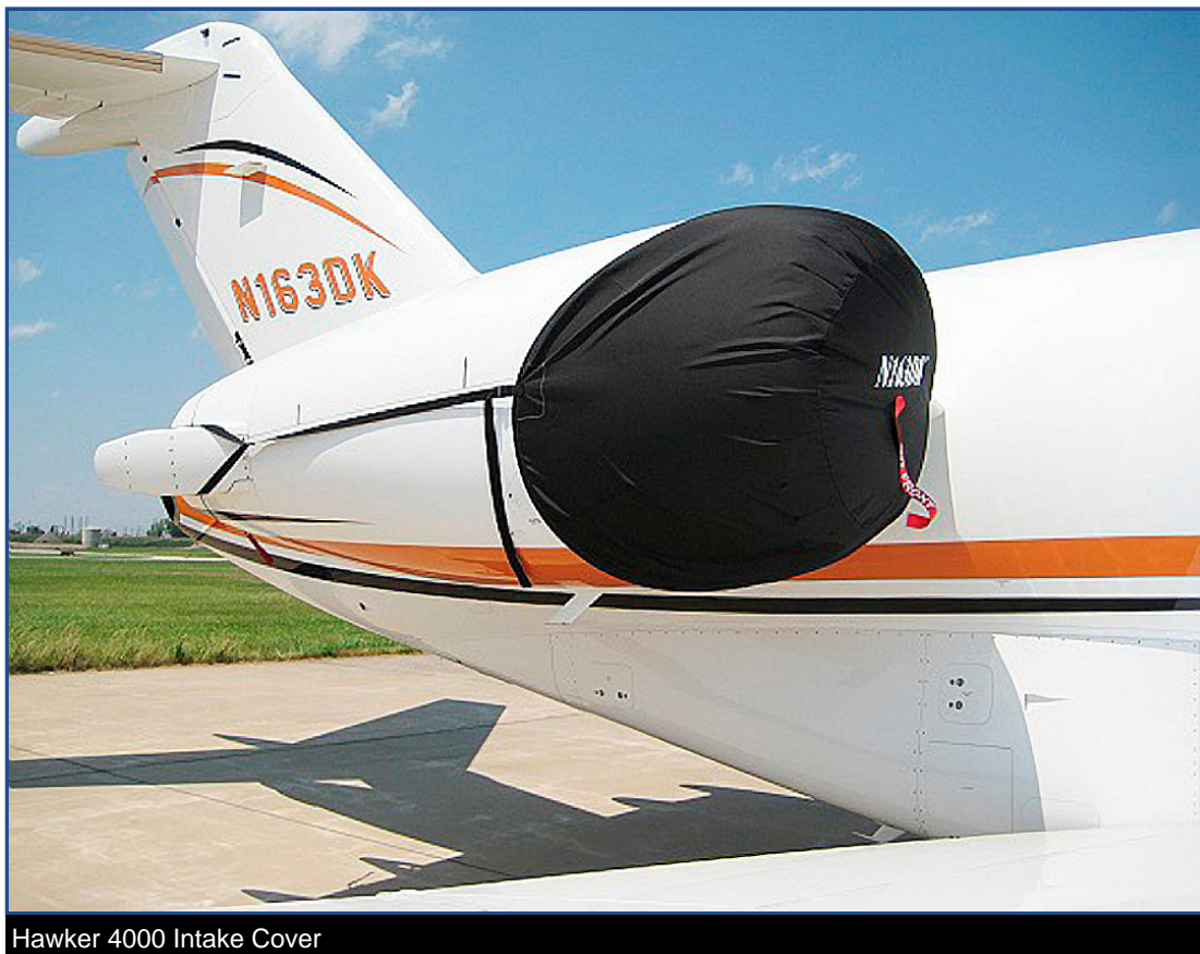
Hawker 4000 Intake Cover