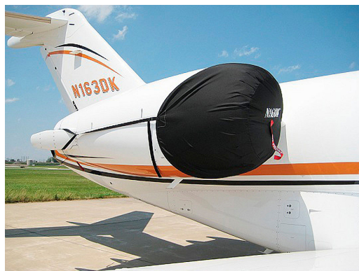
Hawker 4000 Intake Cover