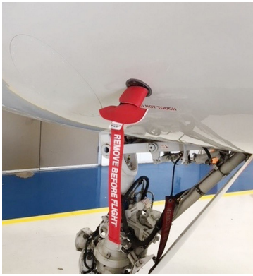
Grumman Gulfstream G-V Rosemont/TAT Cover