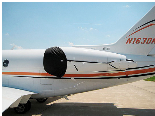
Hawker 4000 Intake Cover

The Hawker Beechcraft 4000 Horizon Intake Covers are designed to install easily yet be completely storable. A spring steel hoop is sewn into the hem of each cover, allowing them to be installed without climbing onto the wing or using a stepladder. To store the covers the spring steel hoop folds like a band-saw blade into three nesting rings. Each cover folds into a compact circular bundle which is stored in the included duffle bag, yet they unfold quickly for use. The Tri-Fold Ring cover is made of medium weight nylon which is available in a variety of colors to match the paint trim. Each cover set comes complete with installation and folding instructions. The aircraft's registration number can be silkscreened onto the cover for an extra charge.