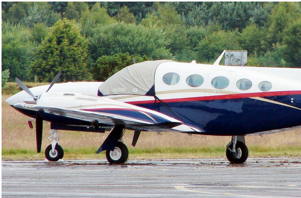
Cessna 421 Cockpit Cover