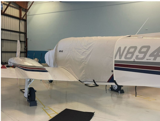
Cessna 340 Extended Canopy/Nose Cover

This cover type is made from Silver Acrylic Sunbrella canvas and is 100% lined with a soft and smooth microfiber. Bruce's Custom Covers developed this material combination especially for aircraft protection. The outer material is medium weight and treated for water resistance, UV resistance and anti-static buildup. The inner lining is a very soft and smooth microfiber to prevent scratching. The material is very reflective, and tests show that the cabin interior temperature can be reduced to near-ambient temperature on the hottest of days. It is water, ice and snow repellent, yet breathable to allow moisture to escape from between the cover and the aircraft surface.