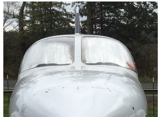
Cessna 421 Windshield HeatShields