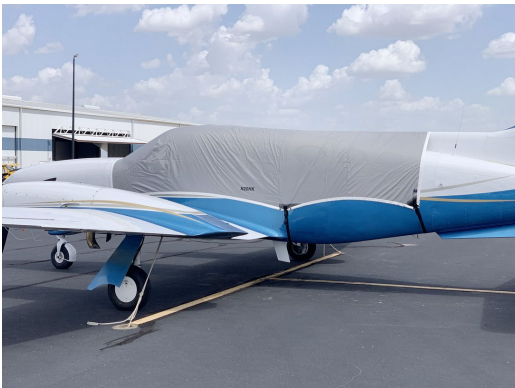
Cessna 414 Travel Weight Canopy Cover

Travel Covers are made with Silver Solution-Dyed Polyester fabric and only lined over the windshield to save weight. The material is lightweight and more compact for easy stowage in the aircraft. The polyester material is water resistant, but only intended for occasional use outside. We also have an ultra lightweight material available for fitted hangar dust covers. For daily outdoor use, the non-travel Sunbrella Cover is the best choice.