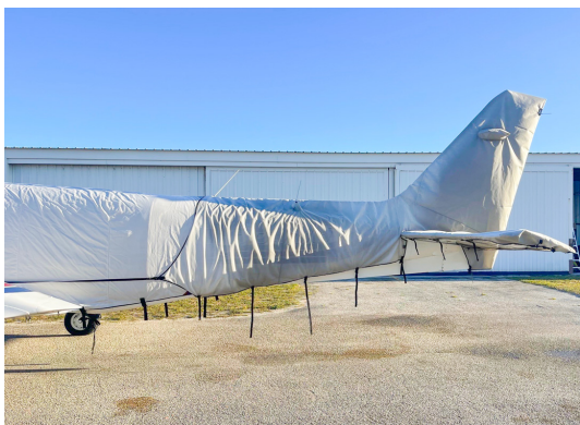
Cessna 335, 340 Empennage Cover (Tailboom, Vertical & Horiz Stabilizers), All Year Use