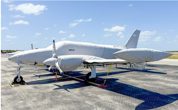
Cessna 340 Complete Cover Set