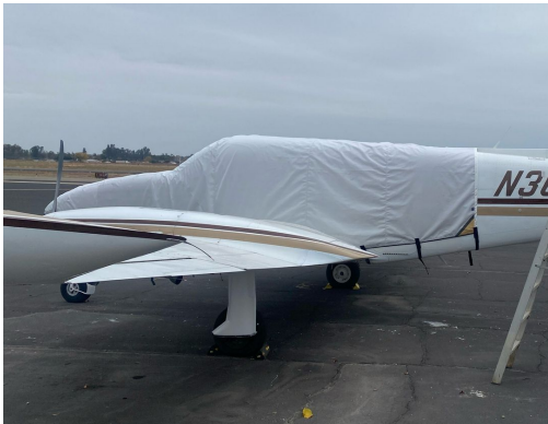
Cessna 340 Extended Canopy/Nose Cover

This cover type is made from Silver Acrylic Sunbrella canvas and is 100% lined with a soft and smooth microfiber. Bruce's Custom Covers developed this material combination especially for aircraft protection. The outer material is medium weight and treated for water resistance, UV resistance and anti-static buildup. The inner lining is a very soft and smooth microfiber to prevent scratching. The material is very reflective, and tests show that the cabin interior temperature can be reduced to near-ambient temperature on the hottest of days. It is water, ice and snow repellent, yet breathable to allow moisture to escape from between the cover and the aircraft surface.