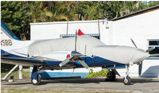
Cessna 421 Canopy Cover & Nose Cover