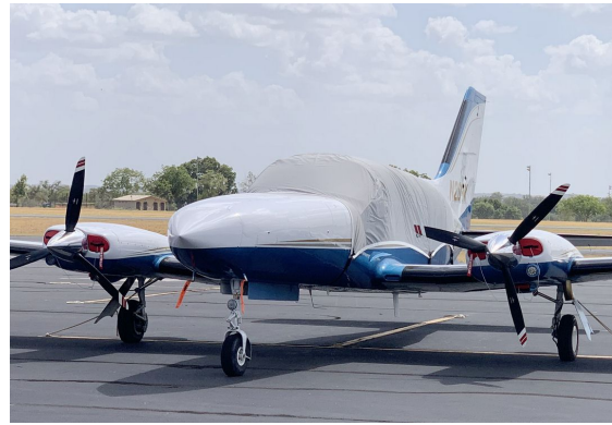
Cessna 414 Travel Weight Canopy Cover, Engine Plugs