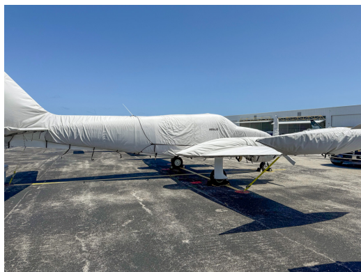
Cessna 340 Complete Cover Set

WINTER USE MATERIAL - Made with Solution-Dyed Polyester fabric, this option is intended for seasonal use to aid in deicing, rain mitigation, or for occasional travel. The material is lighter and more compact, but more susceptible to UV damage and may have a shorter useful life if used continuously outside than the all-year use material.