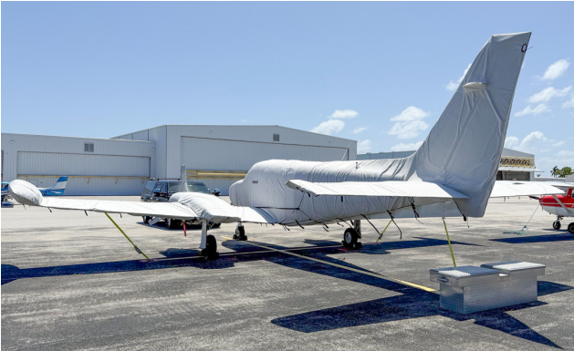
Cessna 340 Complete Cover Set

This cover type is made from Silver Acrylic Sunbrella canvas and is 100% lined with a soft and smooth microfiber. Bruce's Custom Covers developed this material combination especially for aircraft protection. The outer material is medium weight and treated for water resistance, UV resistance and anti-static buildup. The inner lining is a very soft and smooth microfiber to prevent scratching. The material is very reflective, and tests show that the cabin interior temperature can be reduced to near-ambient temperature on the hottest of days. It is water, ice and snow repellent, yet breathable to allow moisture to escape from between the cover and the aircraft surface.