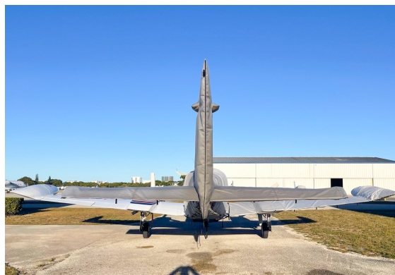
Cessna 340 Empennage Cover, Wing/Engine Covers