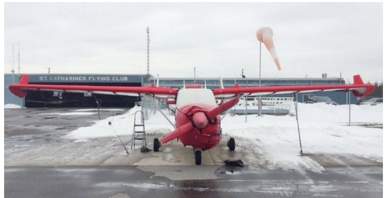
Cessna 337 Skymaster Winter Cover Set