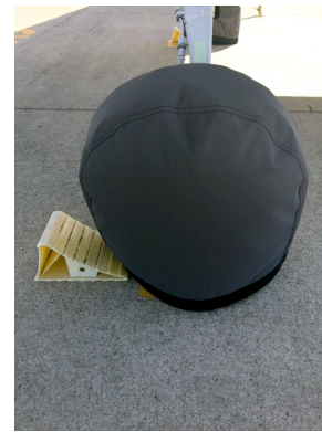
Cessna 337 Skymaster (O-2, O-2A) Tire Covers