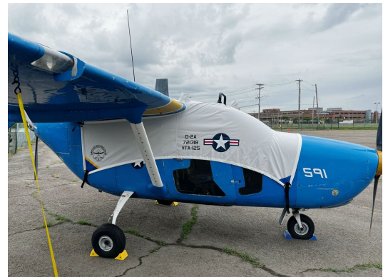
Cessna 337 Skymaster Canopy Cover with Forward "Bib"