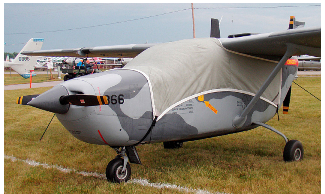
Cessna 337 Skymaster Canopy Cover w/ 14" bib ext.