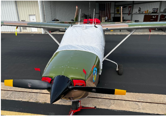
Cessna 337 Skymaster Canopy Cover with 14" bib ext., Engine Plugs

necessary. Engine plugs have warning flags that are visible from the cockpit or 'remove before flight' streamers sewn onto the face of the plugs. Most plugs are imprinted with the aircraft registration number in black for an extra charge. Storage bag NOT included. Engine plugs may be inserted after flight when the engine is still warm. Engine Inlet Plugs are commonly referred to as Cowl Plugs, Intake Plugs, Cowl Blocks, Engine Blocks, and Engine Bungs.