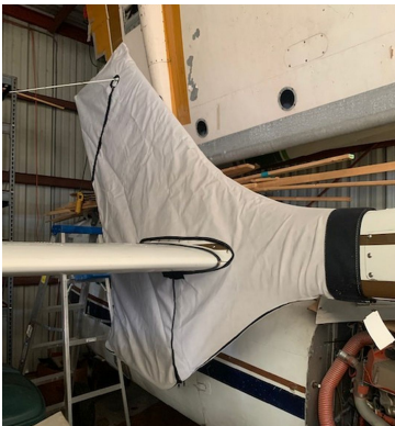
Cessna 337 Skymaster Vertical Stabilizer Covers

WINTER USE MATERIAL - Made with Solution-Dyed Polyester fabric, this option is intended for seasonal use to aid in deicing, rain mitigation, or for occasional travel. The material is lighter and more compact, but more susceptible to UV damage and may have a shorter useful life if used continuously outside than the all-year use material.