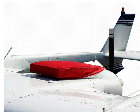
Cessna 337 Skymaster Aft Engine Inlet Cover, hoop type, & outlet plugs (SOLD SEPARATELY)