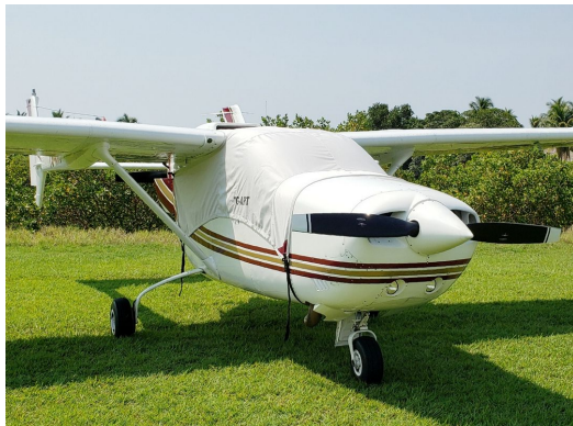
Cessna 337 Skymaster Canopy Cover w/14" Bib Extension

This cover type is made from Silver Acrylic Sunbrella canvas and is 100% lined with a soft and smooth microfiber. Bruce's Custom Covers developed this material combination especially for aircraft protection. The outer material is medium weight and treated for water resistance, UV resistance and anti-static buildup. The inner lining is a very soft and smooth microfiber to prevent scratching. The material is very reflective, and tests show that the cabin interior temperature can be reduced to near-ambient temperature on the hottest of days. It is water, ice and snow repellent, yet breathable to allow moisture to escape from between the cover and the aircraft surface.