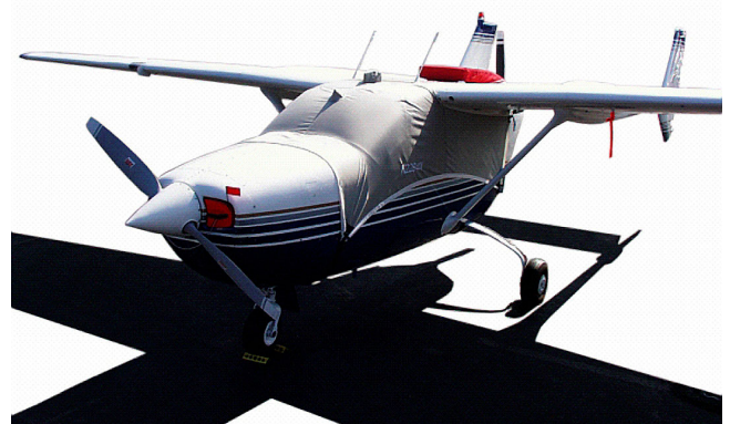
Cessna Skymaster Canopy Cover with Forward Extension, Fwd. Engine Plugs, Aft Engine Cover