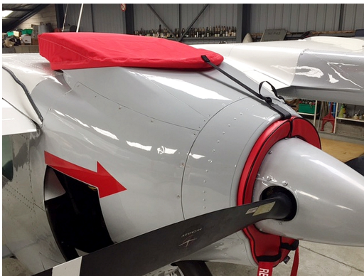
Cessna 337 Skymaster Aft Engine Inlet Cover, hoop type, & outlet plugs (SOLD SEPARATELY)

Engine Inlet Plugs are custom fit for your Cessna 336 (Fixed Gear Skymaster) intakes, made with heavy-duty vinyl material, and stuffed with a single block of sculpted urethane foam. Each plug has a zipper that allows the foam to be removed and dried if necessary. Engine plugs have warning flags that are visible from the cockpit or 'remove before flight' streamers sewn onto the face of the plugs. Most plugs are imprinted with the aircraft registration number in black for an extra charge. Storage bag NOT included. Engine plugs may be inserted after flight when the engine is still warm. Engine Inlet Plugs are commonly referred to as Cowl Plugs, Intake Plugs, Cowl Blocks, Engine Blocks, and Engine Bung.