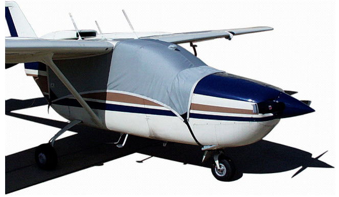
Cessna Skymaster Canopy Cover with Forward Extension