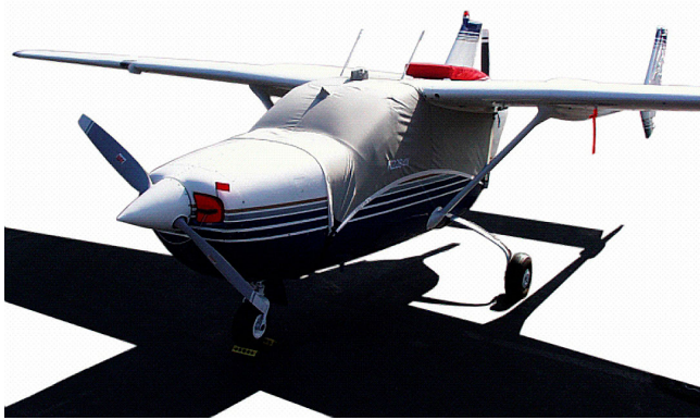
Cessna Skymaster Canopy Cover with Forward Extension, Fwd. Engine Plugs, Aft Engine Cover

This cover type is made from Silver Acrylic Sunbrella canvas and is 100% lined with a soft and smooth microfiber. Bruce's Custom Covers developed this material combination especially for aircraft protection. The outer material is medium weight and treated for water resistance, UV resistance and anti-static buildup. The inner lining is a very soft and smooth microfiber to prevent scratching. The material is very reflective, and tests show that the cabin interior temperature can be reduced to near-ambient temperature on the hottest of days. It is water, ice and snow repellent, yet breathable to allow moisture to escape from between the cover and the aircraft surface.