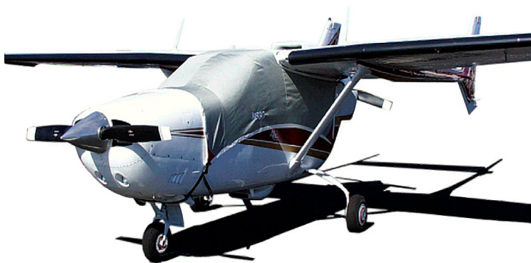
Cessna Skymaster Canopy Cover w/ 14" bib ext.

This cover type is made from Silver Acrylic Sunbrella canvas and is 100% lined with a soft and smooth microfiber. Bruce's Custom Covers developed this material combination especially for aircraft protection. The outer material is medium weight and treated for water resistance, UV resistance and anti-static buildup. The inner lining is a very soft and smooth microfiber to prevent scratching. The material is very reflective, and tests show that the cabin interior temperature can be reduced to near-ambient temperature on the hottest of days. It is water, ice and snow repellent, yet breathable to allow moisture to escape from between the cover and the aircraft surface.