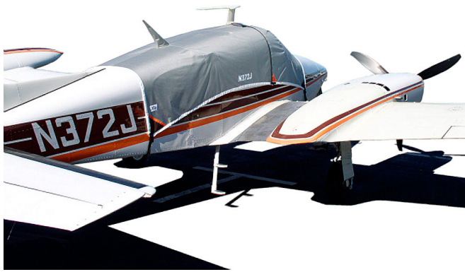
Cessna 320 Canopy Cover