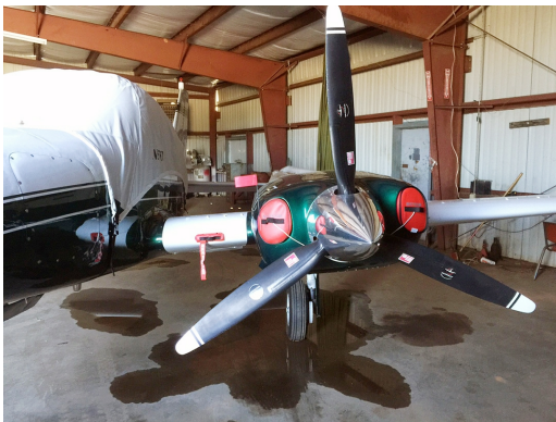
Cessna 310 Engine and Center Section Plugs

Engine Inlet Plugs are custom fit for your Cessna 320 intakes, made with heavy-duty vinyl material, and stuffed with a single block of sculpted urethane foam. Each plug has a zipper that allows the foam to be removed and dried if necessary. Engine plugs have warning flags that are visible from the cockpit or 'remove before flight' streamers sewn onto the face of the plugs. Most plugs are imprinted with the aircraft registration number in black for an extra charge. Storage bag NOT included. Engine plugs may be inserted after flight when the engine is still warm. Engine Inlet Plugs are commonly referred to as Cowl Plugs, Intake Plugs, Cowl Blocks, Engine Blocks, and Engine Bungs.