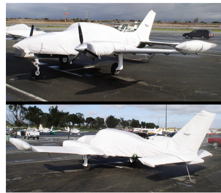
Cessna 310 Complete Cover Set