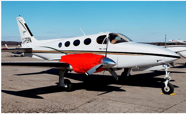
Cessna 340 Insulated Engine Covers