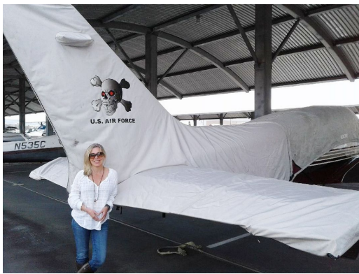
Cessna 310R Empennage Cover