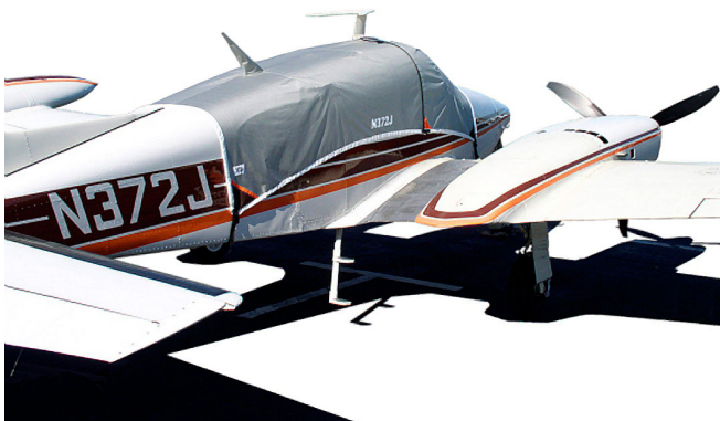
Cessna 320 Canopy Cover

Travel Covers are made with Silver Solution-Dyed Polyester fabric and only lined over the windshield to save weight. The material is lightweight and more compact for easy stowage in the aircraft. The polyester material is water resistant, but only intended for occasional use outside. We also have an ultra lightweight material available for fitted hangar dust covers. For daily outdoor use, the non-travel Sunbrella Cover is the best choice.