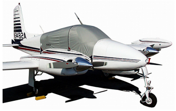
Cessna 310A Canopy Cover