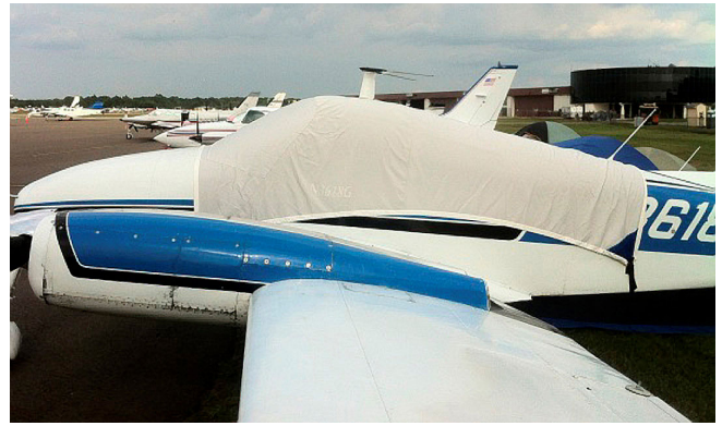
Cessna 310 Canopy Cover