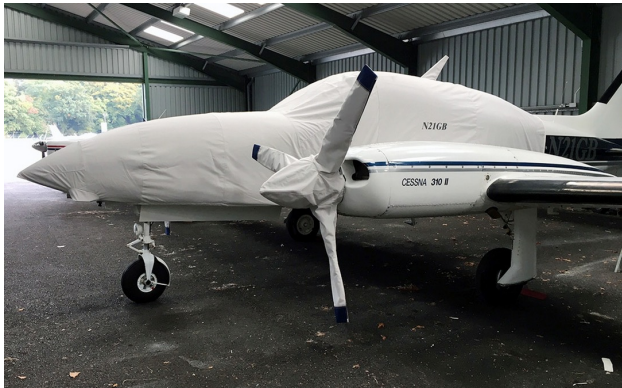
Cessna 310R Extended Canopy/Engine Cover, 3-Blade Prop Covers

This cover type is made from Silver Acrylic Sunbrella canvas and is 100% lined with a soft and smooth microfiber. Bruce's Custom Covers developed this material combination especially for aircraft protection. The outer material is medium weight and treated for water resistance, UV resistance and anti-static buildup. The inner lining is a very soft and smooth microfiber to prevent scratching. The material is very reflective, and tests show that the cabin interior temperature can be reduced to near-ambient temperature on the hottest of days. It is water, ice and snow repellent, yet breathable to allow moisture to escape from between the cover and the aircraft surface.