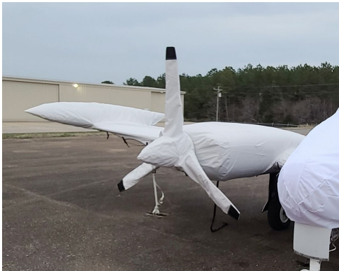
Cessna 310Q Wing/Engine Covers, Prop Covers