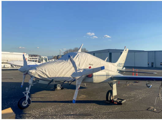
Cessna 310G Extended Canopy/Nose Cover, ext. to tail