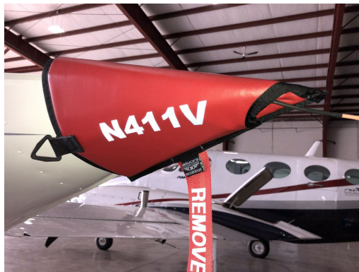
Cessna 335, 340 Wingtip Pads

Designed to prevent damage to the aircraft extremities in crowded hangars, these products are made of bright red Naugahyde and thickly padded with a sandwich of closed cell foam.