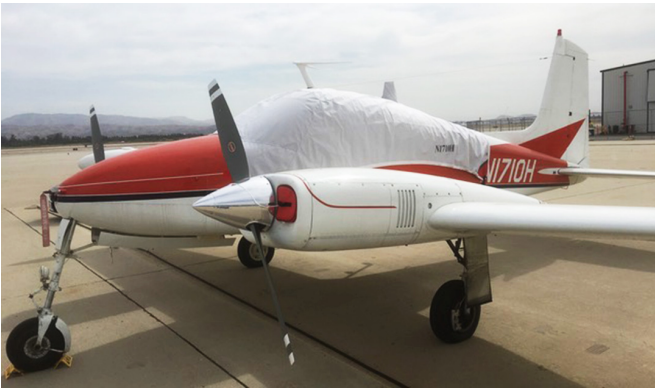
Cessna 310 Canopy Cover and Inlet Plugs