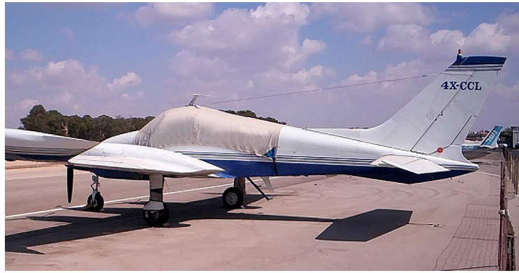
Cessna 310 Canopy Cover