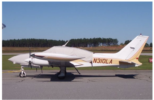
Cessna 310R Canopy/Nose Cover