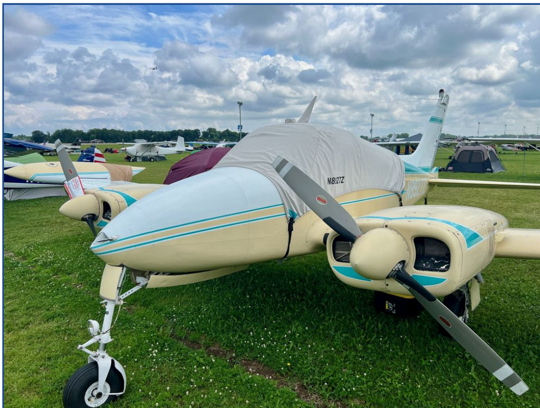
Cessna 310G Canopy Cover