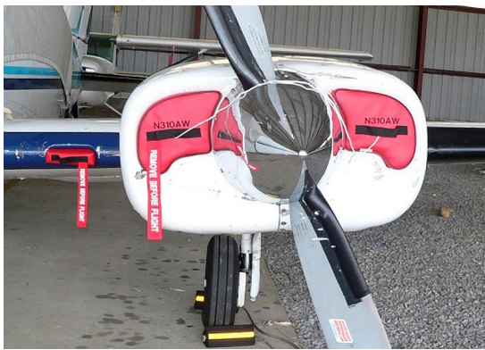
Cessna 310P Engine Inlet and Center Section Inlet Plugs