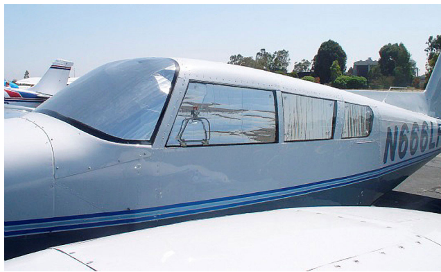
Piper PA-30 Twin Comanche Cockpit HeatShields