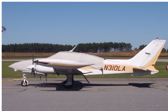
Cessna 310R Canopy/Nose Cover