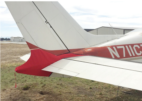
Cessna 310 Tailcone Cover

WINTER USE MATERIAL - Made with Solution-Dyed Polyester fabric, this option is intended for seasonal use to aid in deicing, rain mitigation, or for occasional travel. The material is lighter and more compact, but more susceptible to UV damage and may have a shorter useful life if used continuously outside than the all-year use material.