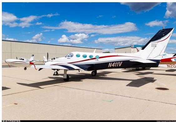
Cessna 340 Wingtip Pads

Designed to prevent damage to the aircraft extremities in crowded hangars, these products are made of bright red Naugahyde and thickly padded with a sandwich of closed cell foam.