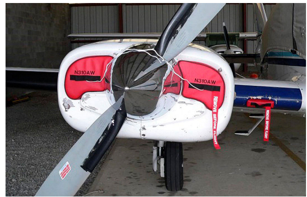
Cessna 310P Engine Inlet and Center Section Inlet Plugs