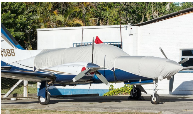
Cessna 421 Canopy Cover & Nose Cover