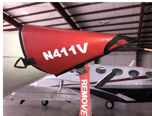
Cessna 335, 340 Wingtip Pads