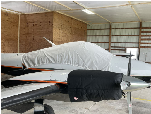
Cessna 310K Canopy & Insulated Engine Covers