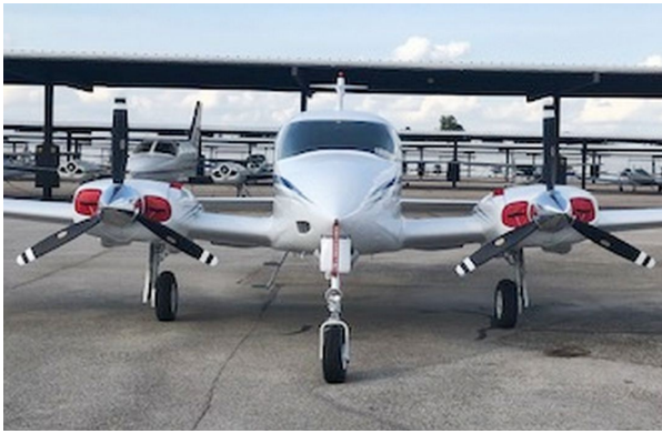
Cessna 310L Engine Inlet Plugs