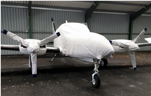
Cessna 310 Extended Canopy/Nose and Propellor Covers

This cover type is made from Silver Acrylic Sunbrella canvas and is 100% lined with a soft and smooth microfiber. Bruce's Custom Covers developed this material combination especially for aircraft protection. The outer material is medium weight and treated for water resistance, UV resistance and anti-static buildup. The inner lining is a very soft and smooth microfiber to prevent scratching. The material is very reflective, and tests show that the cabin interior temperature can be reduced to near-ambient temperature on the hottest of days. It is water, ice and snow repellent, yet breathable to allow moisture to escape from between the cover and the aircraft surface.