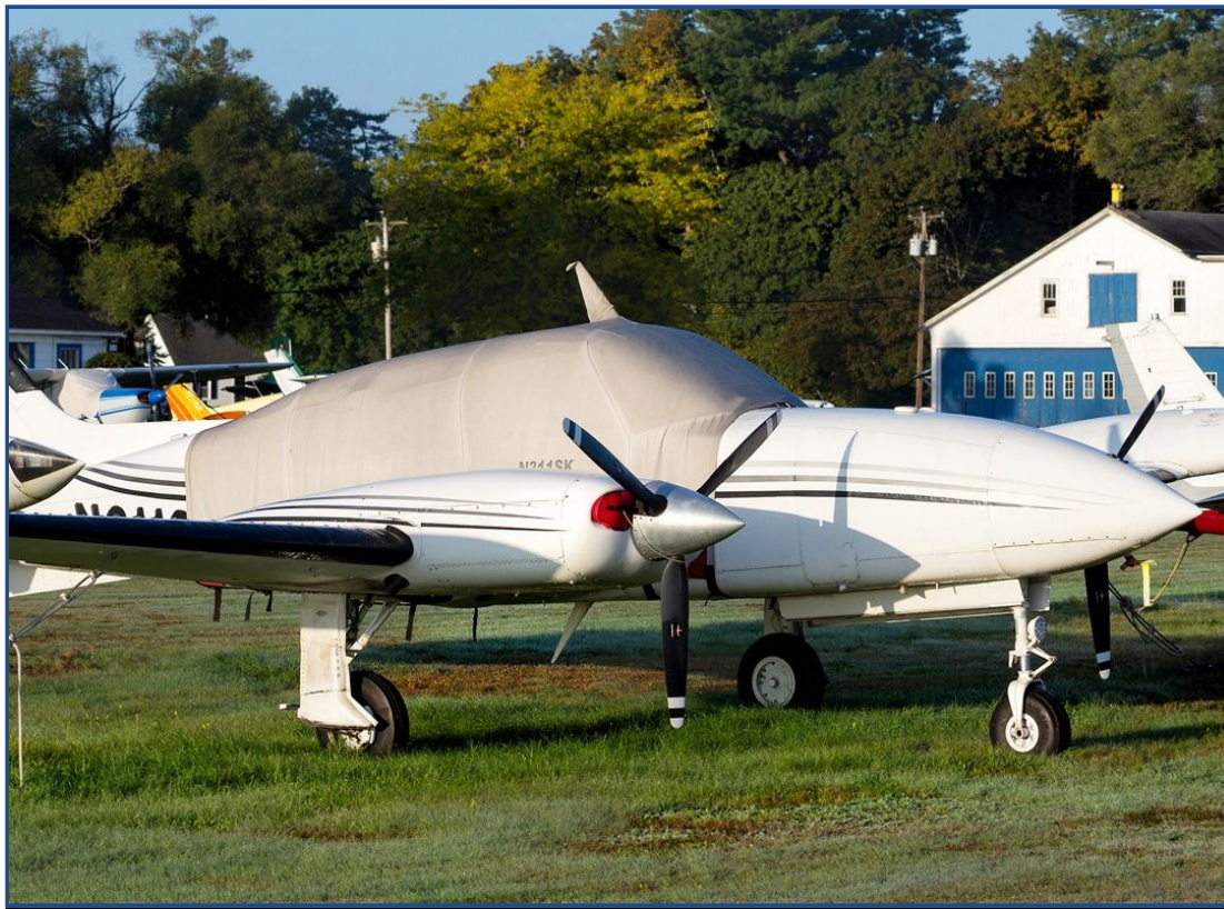
Cessna 310 Canopy Cover (St. Back, No Rear Window Models)