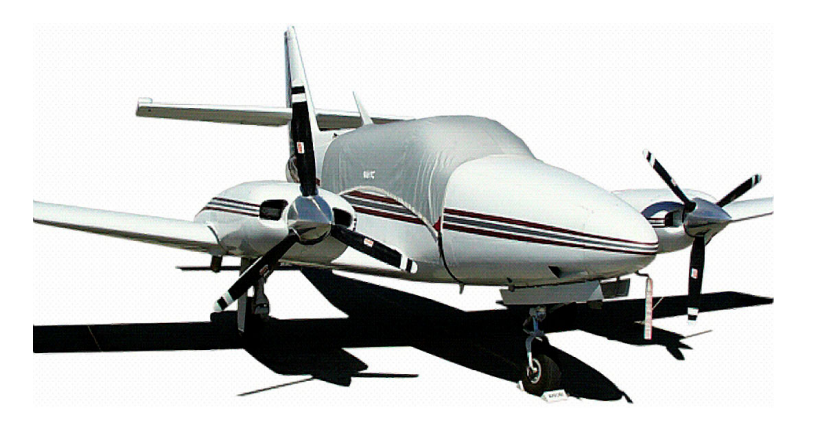
Cessna Crusader Standard Canopy Cover