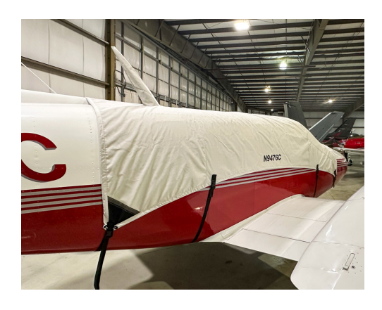
Cessna T303 Canopy Cover