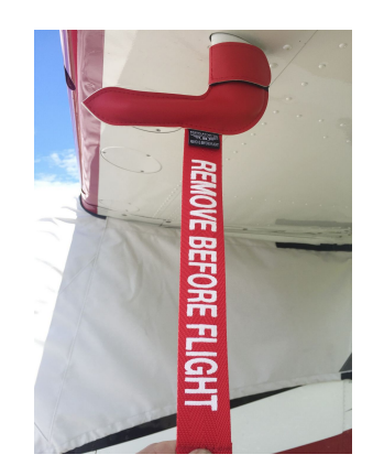
Cessna A185F Pitot Cover