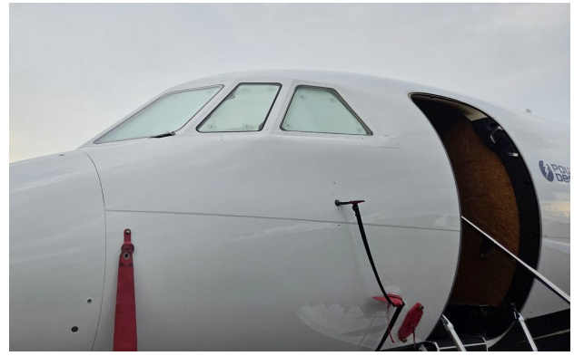
Dassault Aviation FALCON 2000EX Cockpit Heatshields (set of 7)