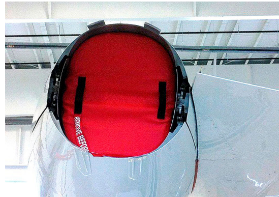
Falcon 2000EX Exhaust Plug