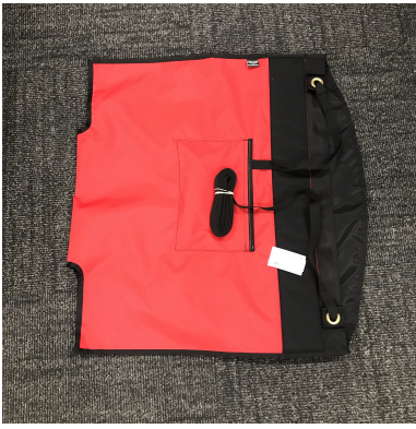
Full size blade cover.