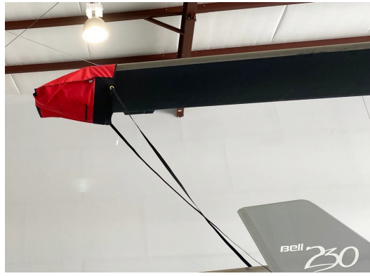
Bell 230 Blade Tie-Downs, (Semi-Rigid) W/Telescoping Attachment Handle