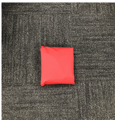
Folds down small.