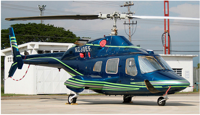
Bell 230 Engine Plugs, HeatShields

Heatshields are interior sunshades for an aircraft's windows or canopy glass. The product is a unique composite of closed-cell foam with a silver mylar finish. The semi-rigid design is stiff enough to stand along the inside of the windshield using sun visors or window framing. It folds up flat and easily stores in the included storage sleeve. Some designs may require velcro and suction cups. A Heatshield is an excellent short-term remedy for cockpit overheating.