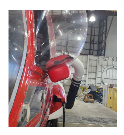
Boeing Vertol CH-47 Logger Window Plug