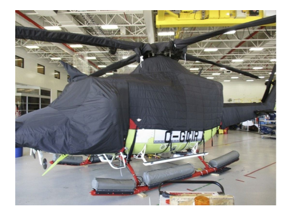
Bell 412 Forward Cabin/Nose, Insulated Engine, Tailboom, Rotor Hub & Blade Covers