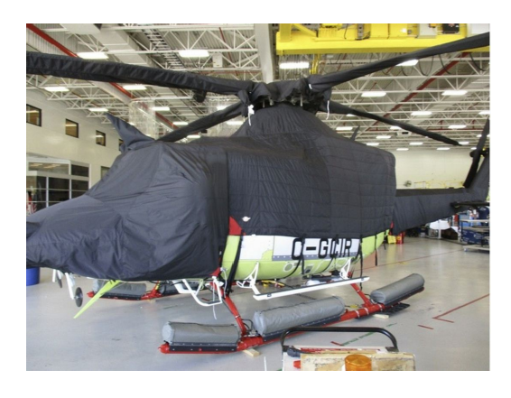
Bell 412 Cockpit/Canopy/Nose, Insulated Engine Area, Rotor Hub, Blade, Tailboom and Tail Rotor Coversroto