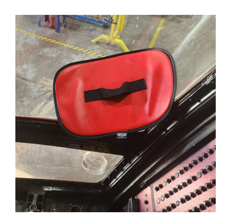
Boeing Vertol CH-47 Logger Window Plug

The Engine Inlet Plugs are custom fit for your Bell 212 intakes, made with heavy-duty vinyl material, and stuffed with a single block of sculpted urethane foam. Each plug has a zipper that allows the foam to be removed and dried if necessary. Engine plugs have 'Remove Before Flight' streamers sewn onto the face of the plugs. Most plugs are imprinted with the aircraft registration number in black for an extra charge. Storage bag NOT included. Engine plugs may be inserted after flight when the engine is still warm. Engine Inlet Plugs are commonly referred to as Cowl Plugs, Intake Plugs, Cowl Blocks, Engine Blocks, and Engine Bungs.