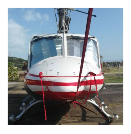
Bell 212 Windshield HeatShields

Cockpit Heatshields are interior sunshades for the aircraft's cockpit. The product is a unique composite of closed-cell foam with a silver mylar finish. The semi-rigid design is stiff enough to stand inside the window framing. Darts and folds are incorporated into the material so that it conforms to the complex shape of the helicopter windows. The set folds up flat and is easily stored in the included storage sleeve. Some designs may require velcro and suction cups. A Heatshield is an excellent short-term remedy for cockpit overheating, but an external fabric cover is more effective for long-term protection.