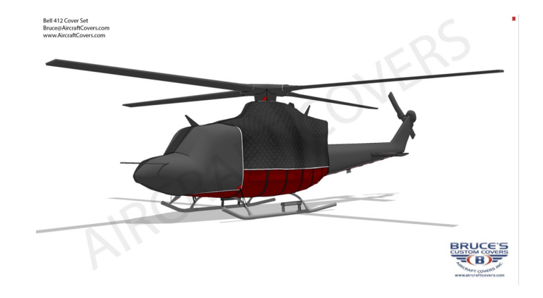
Hub, Blade, Tailboom and Tail Rotor Covers