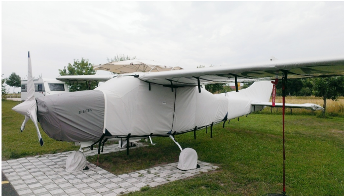
Cessna 210 Complete Cover Set

WINTER USE MATERIAL - Made with Solution-Dyed Polyester fabric, this option is intended for seasonal use to aid in deicing, rain mitigation, or for occasional travel. The material is lighter and more compact, but more susceptible to UV damage and may have a shorter useful life if used continuously outside than the all-year use material.