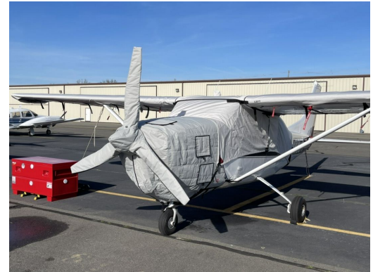
Cessna 210 Winter Cover Set