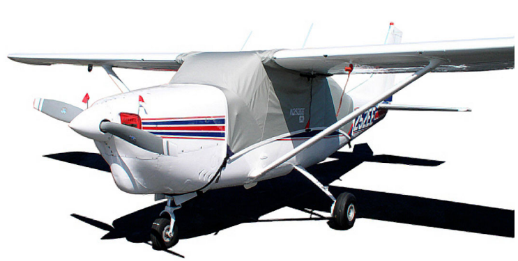
Cessna 210 Over-Top Canopy Cover