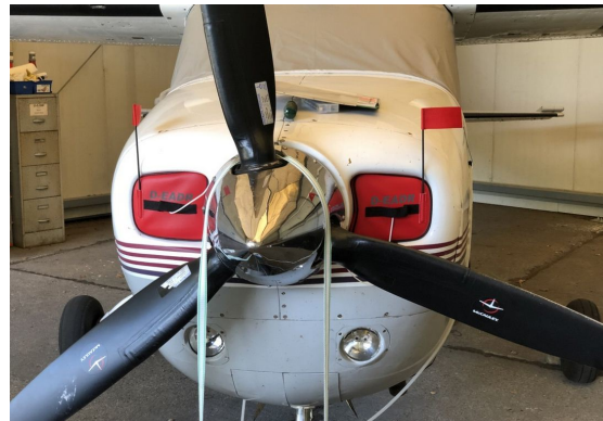
Cessna 210 Engine Plugs