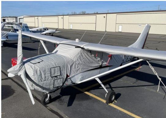
Cessna 210 Winter Cover Set

WINTER USE MATERIAL - Made with Solution-Dyed Polyester fabric, this option is intended for seasonal use to aid in deicing, rain mitigation, or for occasional travel. The material is lighter and more compact, but more susceptible to UV damage and may have a shorter useful life if used continuously outside than the all-year use material.