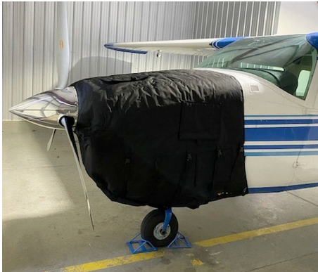
Cessna T210L Insulated Engine Cover

This cover type is made from Silver Acrylic Sunbrella canvas and is 100% lined with a soft and smooth microfiber. Bruce's Custom Covers developed this material combination especially for aircraft protection. The outer material is medium weight and treated for water resistance, UV resistance and anti-static buildup. The inner lining is a very soft and smooth microfiber to prevent scratching. The material is very reflective, and tests show that the cabin interior temperature can be reduced to near-ambient temperature on the hottest of days. It is water, ice and snow repellent, yet breathable to allow moisture to escape from between the cover and the aircraft surface.