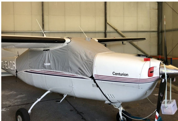
Cessna 210 Travel Weight Canopy Cover

Travel Covers are made with Silver Solution-Dyed Polyester fabric and only lined over the windshield to save weight. The material is lightweight and more compact for easy stowage in the aircraft. The polyester material is water resistant, but only intended for occasional use outside. We also have an ultra lightweight material available for fitted hangar dust covers. For daily outdoor use, the non-travel Sunbrella Cover is the best choice.