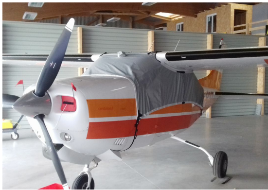
Cessna 210N Engine Inlet Plugs

Engine Inlet Plugs are custom fit for your Cessna 210 Centurion intakes, made with heavy-duty vinyl material, and stuffed with a single block of sculpted urethane foam. Each plug has a zipper that allows the foam to be removed and dried if necessary. Engine plugs have warning flags that are visible from the cockpit or 'remove before flight' streamers sewn onto the face of the plugs. Most plugs are imprinted with the aircraft registration number in black for an extra charge. Storage bag NOT included. Engine plugs may be inserted after flight when the engine is still warm. Engine Inlet Plugs are commonly referred to as Cowl Plugs, Intake Plugs, Cowl Blocks, Engine Blocks, and Engine Bungs.