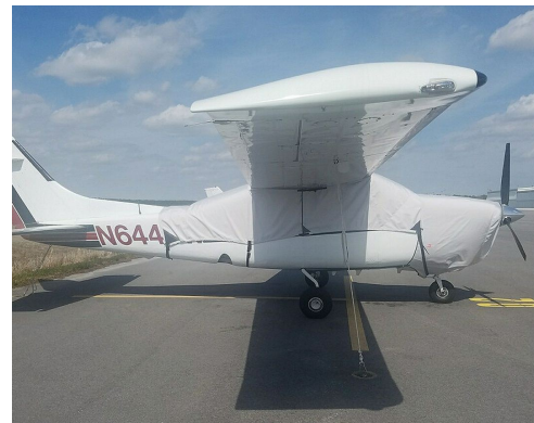
Cessna 210 Over-Top Canopy Cover, Fully Enclosed Engine Cover