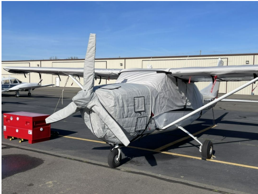
Cessna 210 Winter Cover Set