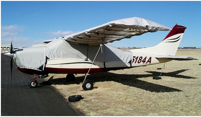
Cessna 210 Engine, Canopy Cover w/ Baggage Door ext. & Wing Covers