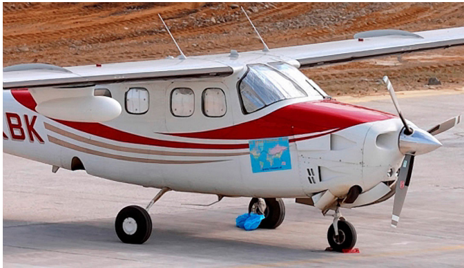
Cessna P210 HeatShield Set