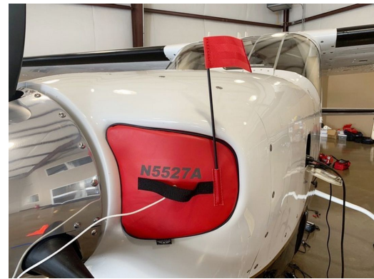
Cessna 210 Centurion Engine Inlet Plugs