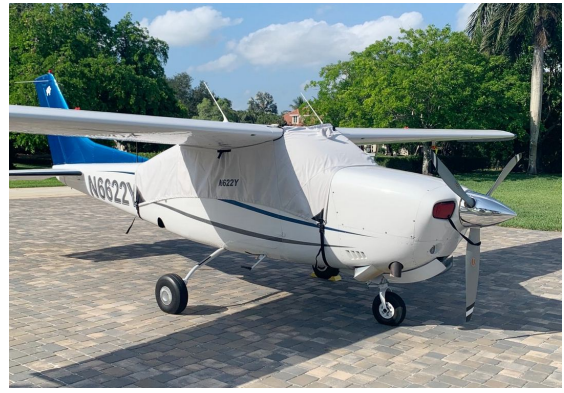
Cessna 210 Canopy Cover, Wrap-Around Type