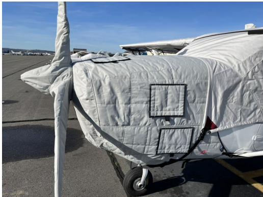
Cessna 210 Winter Cover Set