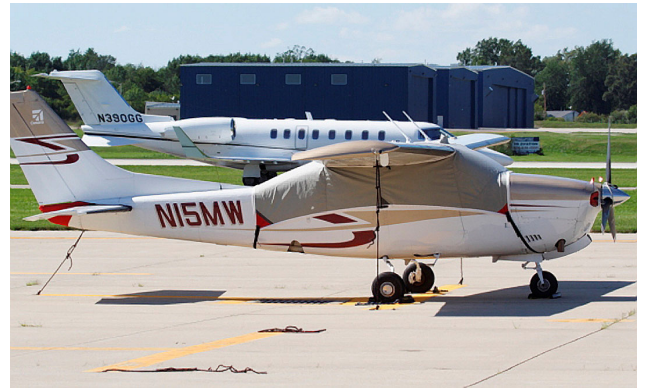
Cessna 210 Canopy Cover, Engine Plugs, Tailcone Cover