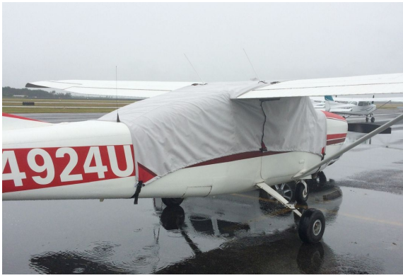
Cessna 210 Over-Top Canopy Cover