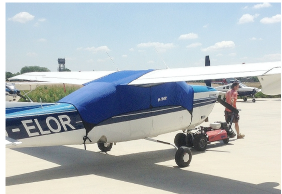
Cessna 210 Over-Top Canopy Cover