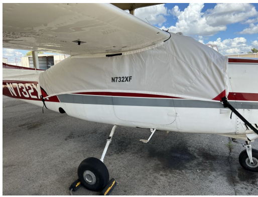
Cessna T210M Canopy Cover