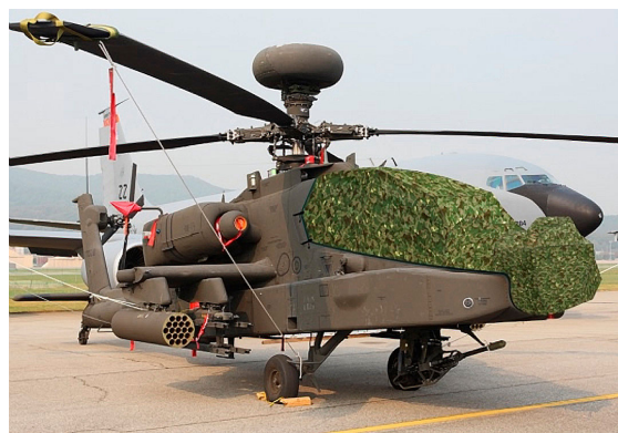
Canopy/Nose Cover, covers canopy glass and TADS