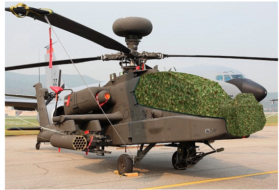
Canopy/Nose Cover, covers canopy glass and TADS