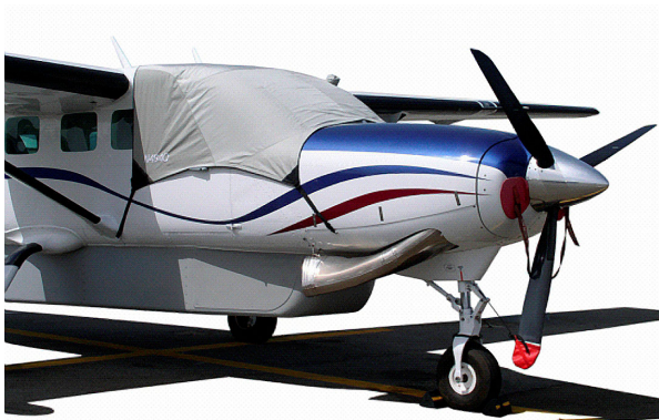
Cessna Caravan Windshield Cover, Plugs, Prop Ties & Pitot Cover

The material is very reflective, and tests show that the cabin interior temperature can be reduced to near-ambient temperature on the hottest of days. It is water, ice and snow repellent, yet breathable to allow moisture to escape from between the cover and the aircraft surface.