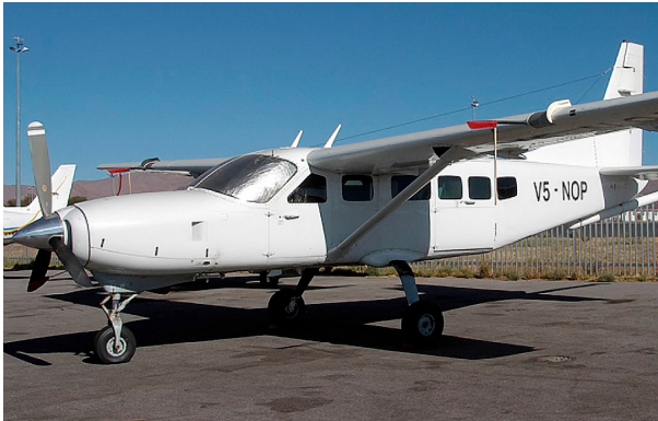
Cessna 208 Caravan Windshield HeatShield