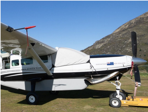
Cessna 208 Caravan Cockpit Cover

This cover type is made from Silver Acrylic Sunbrella canvas and is 100% lined with a soft and smooth microfiber. Bruce's Custom Covers developed this material combination especially for aircraft protection. The outer material is medium weight and treated for water resistance, UV resistance and anti-static buildup. The inner lining is a very soft and smooth microfiber to prevent scratching. The material is very reflective, and tests show that the cabin interior temperature can be reduced to near-ambient temperature on the hottest of days. It is water, ice and snow repellent, yet breathable to allow moisture to escape from between the cover and the aircraft surface.