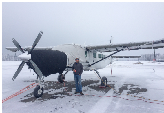
Cessna 208 Caravan Insulated Engine, Cockpit & Wing Covers

This cover type is made from Silver Acrylic Sunbrella canvas and is 100% lined with a soft and smooth microfiber. Bruce's Custom Covers developed this material combination especially for aircraft protection. The outer material is medium weight and treated for water resistance, UV resistance and anti-static buildup. The inner lining is a very soft and smooth microfiber to prevent scratching. The material is very reflective, and tests show that the cabin interior temperature can be reduced to near-ambient temperature on the hottest of days. It is water, ice and snow repellent, yet breathable to allow moisture to escape from between the cover and the aircraft surface.