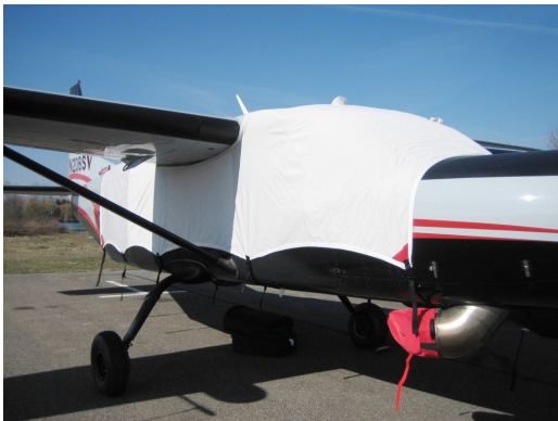
Cessna Caravan Canopy Cover