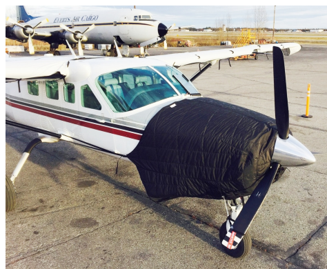
Cessna 208 Caravan Insulated Engine Cover, fully enclosed