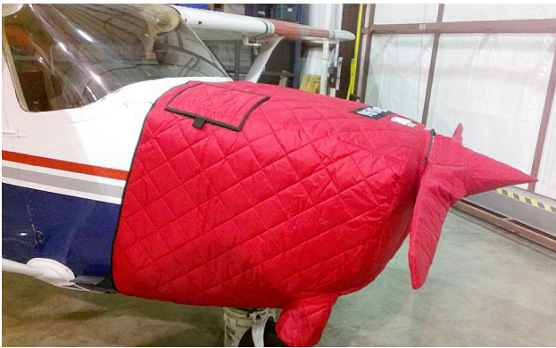
Cessna 172 Insulated Engine Cover w/ Oil Filler Door flap and Insulated Prop/Spinner Cover

This cover type is made from Silver Acrylic Sunbrella canvas and is 100% lined with a soft and smooth microfiber. Bruce's Custom Covers developed this material combination especially for aircraft protection. The outer material is medium weight and treated for water resistance, UV resistance and anti-static buildup. The inner lining is a very soft and smooth microfiber to prevent scratching. The material is very reflective, and tests show that the cabin interior temperature can be reduced to near-ambient temperature on the hottest of days. It is water, ice and snow repellent, yet breathable to allow moisture to escape from between the cover and the aircraft surface.