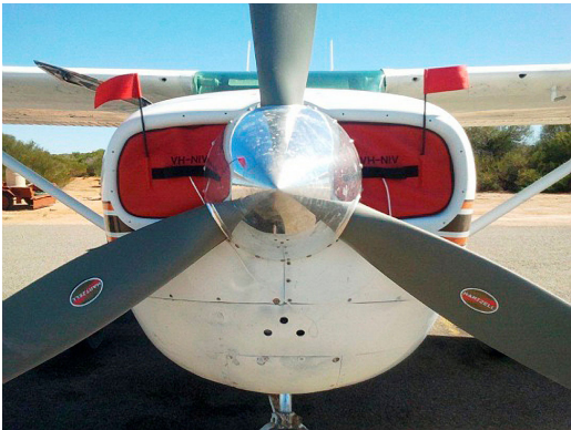
Cessna 207 Engine Inlet Plugs