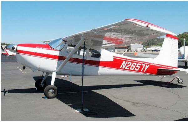
Cessna 180 & 185 Windshield HeatShield