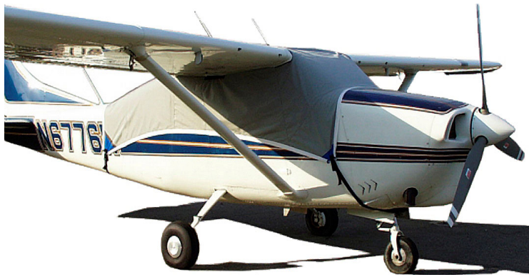
Cessna 206 Standard Canopy Cover

This cover type is made from Silver Acrylic Sunbrella canvas and is 100% lined with a soft and smooth microfiber. Bruce's Custom Covers developed this material combination especially for aircraft protection. The outer material is medium weight and treated for water resistance, UV resistance and anti-static buildup. The inner lining is a very soft and smooth microfiber to prevent scratching. The material is very reflective, and tests show that the cabin interior temperature can be reduced to near-ambient temperature on the hottest of days. It is water, ice and snow repellent, yet breathable to allow moisture to escape from between the cover and the aircraft surface.