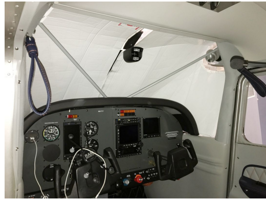
Cessna 180 Skywagon Windshield Heatshield, (W/ Compass)