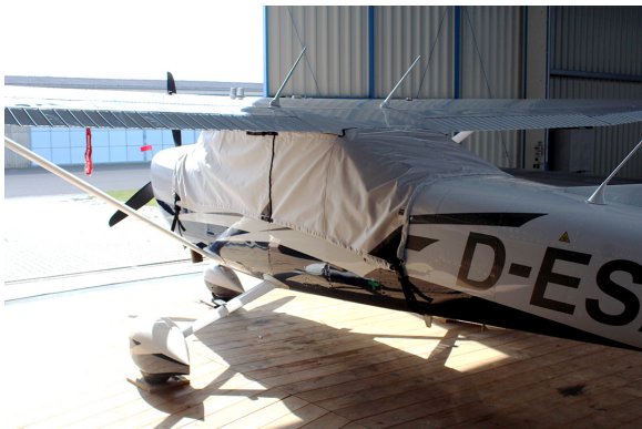
Cessna 206 Stationair Canopy Cover, Wrap-Around