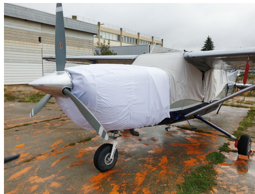
Cessna 207 Engine Cover (test fit)