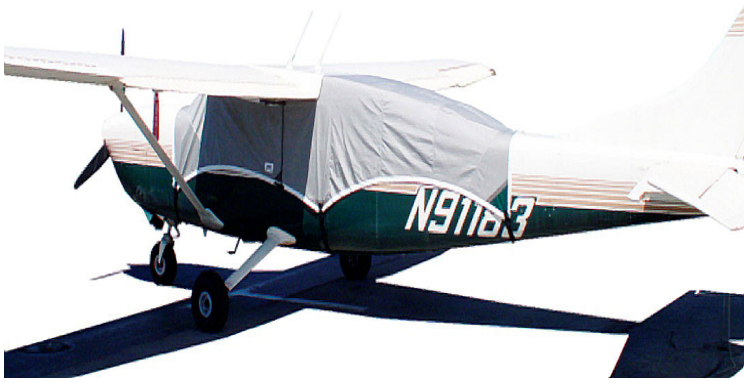
Cessna 207 Canopy Cover