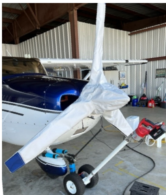
Cessna 182 Skylane 3-Blade Prop Cover

This cover type is made from Silver Acrylic Sunbrella canvas and is 100% lined with a soft and smooth microfiber. Bruce's Custom Covers developed this material combination especially for aircraft protection. The outer material is medium weight and treated for water resistance, UV resistance and anti-static buildup. The inner lining is a very soft and smooth microfiber to prevent scratching. The material is very reflective, and tests show that the cabin interior temperature can be reduced to near-ambient temperature on the hottest of days. It is water, ice and snow repellent, yet breathable to allow moisture to escape from between the cover and the aircraft surface.