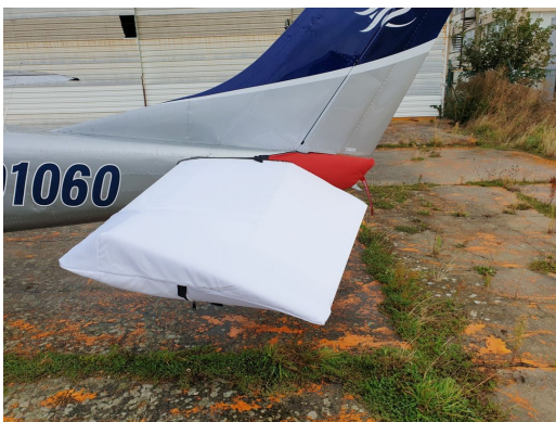
Cessna 207 Tailcone Cover, Horizontal Stab. Cover (test fit)

WINTER USE MATERIAL - Made with Solution-Dyed Polyester fabric, this option is intended for seasonal use to aid in deicing, rain mitigation, or for occasional travel. The material is lighter and more compact, but more susceptible to UV damage and may have a shorter useful life if used continuously outside than the all-year use material.