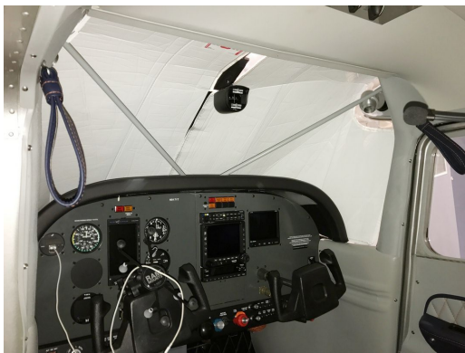
Cessna 180 Skywagon Windshield Heatshield, (W/ Compass)