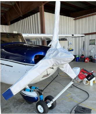
Cessna 182 Skylane 3-Blade Prop Cover