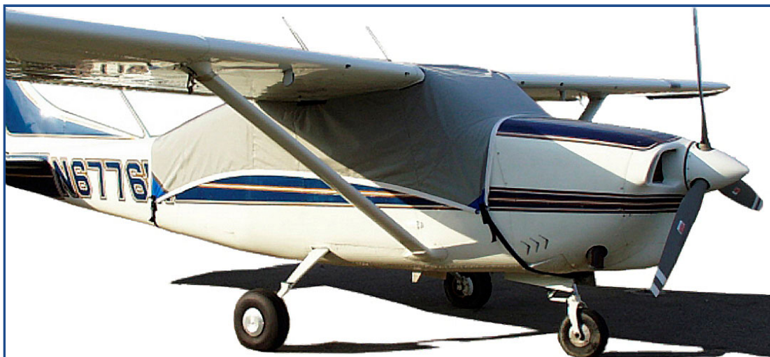
Cessna 206 Standard Canopy Cover