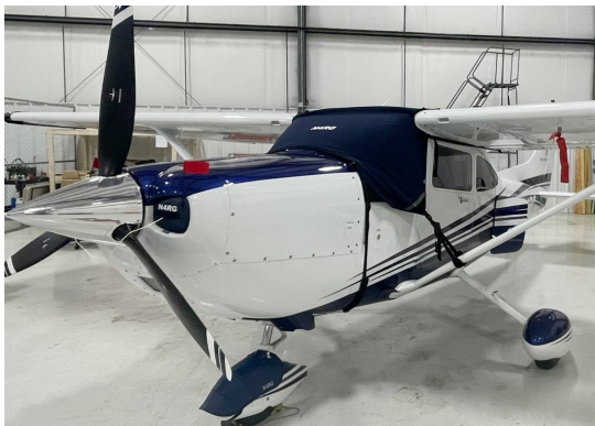
Cessna 182 Windshield Cover, Engine Plugs

This cover type is made from Silver Acrylic Sunbrella canvas and is 100% lined with a soft and smooth microfiber. Bruce's Custom Covers developed this material combination especially for aircraft protection. The outer material is medium weight and treated for water resistance, UV resistance and anti-static buildup. The inner lining is a very soft and smooth microfiber to prevent scratching. The material is very reflective, and tests show that the cabin interior temperature can be reduced to near-ambient temperature on the hottest of days. It is water, ice and snow repellent, yet breathable to allow moisture to escape from between the cover and the aircraft surface.