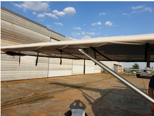
Cessna 207 Wing Covers