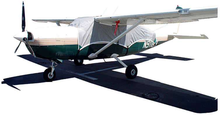
Cessna 207 Canopy Cover