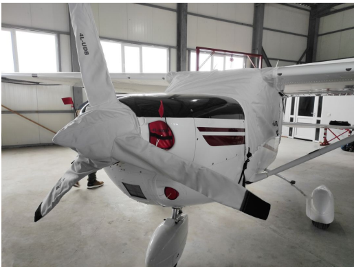
Cessna 206 3-Blade Prop Cover, Engine Plugs