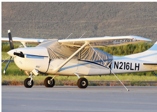
Cessna 206 Travel Cover

Travel Covers are made with Silver Solution-Dyed Polyester fabric and only lined over the windshield to save weight. The material is lightweight and more compact for easy stowage in the aircraft. The polyester material is water resistant, but only intended for occasional use outside. We also have an ultra lightweight material available for fitted hangar dust covers. For daily outdoor use, the non-travel Sunbrella Cover is the best choice.