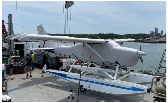
Cessna U206F Amphib Cover Set