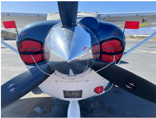
Cessna 206 Engine Inlet & Oil Cooler Plugs