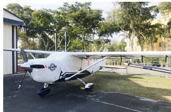
Cessna T206H Canopy, Engine, Wing & Empennage Covers