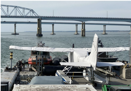
Cessna U206F Amphib Cover Set