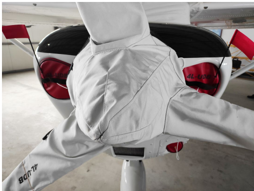
Cessna 206 3-Blade Prop Cover, Engine Plugs

This cover type is made from Silver Acrylic Sunbrella canvas and is 100% lined with a soft and smooth microfiber. Bruce's Custom Covers developed this material combination especially for aircraft protection. The outer material is medium weight and treated for water resistance, UV resistance and anti-static buildup. The inner lining is a very soft and smooth microfiber to prevent scratching. The material is very reflective, and tests show that the cabin interior temperature can be reduced to near-ambient temperature on the hottest of days. It is water, ice and snow repellent, yet breathable to allow moisture to escape from between the cover and the aircraft surface.