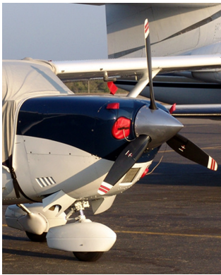
Cessna T206H Engine Inlet Plugs

be inserted after flight when the engine is still warm. Engine Inlet Plugs are commonly referred to as Cowl Plugs , Intake Plugs , Cowl Blocks , Engine Blocks , and Engine Bungs .