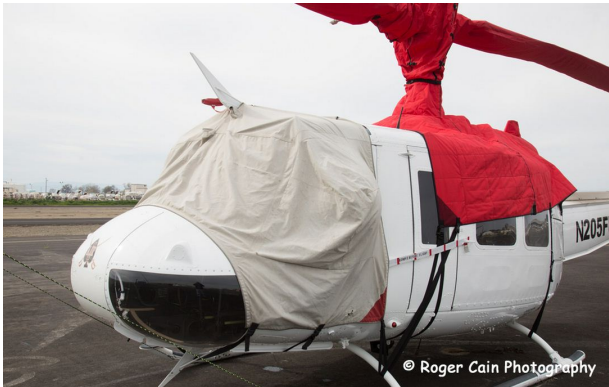
Bell 205 Engine, Rotor Mast, Blades & Forward Cabin Covers

This cover type is made from Silver Acrylic Sunbrella canvas and is 100% lined with a soft and smooth microfiber. Bruce's Custom Covers developed this material combination especially for aircraft protection. The outer material is medium weight and treated for water resistance, UV resistance and anti-static buildup. The inner lining is a very soft and smooth microfiber to prevent scratching. The material is very reflective, and tests show that the cabin interior temperature can be reduced to near-ambient temperature on the hottest of days. It is water, ice and snow repellent, yet breathable to allow moisture to escape from between the cover and the aircraft surface.