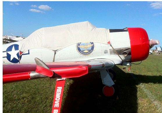
T6 Pitot, Canopy & Prop Covers