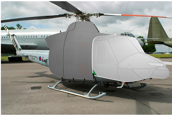
Forward Cabin Nose & Mid-Cabin/Engine Cover (extended to cross tubes)

the hottest of days. It is water, ice and snow repellent, yet breathable to allow moisture to escape from between the cover and the aircraft surface.