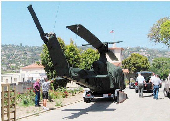
Bell 204/205 Full Body Cover Set