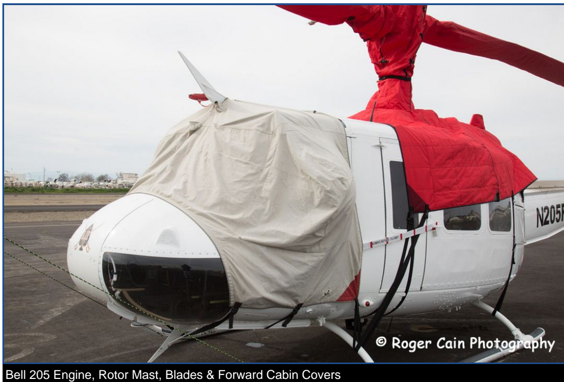
Bell 205 Engine, Rotor Mast, Blades &amp; Forward Cabin Covers