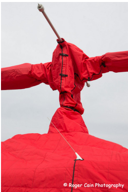
Bell 205 Engine, Rotor Mast & Blades Covers