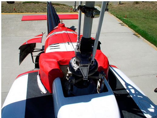
Bell 204 Particle Separator (intake) Cover

WINTER USE MATERIAL - Made with Solution-Dyed Polyester fabric, this option is intended for seasonal use to aid in deicing, rain mitigation, or for occasional travel. The material is lighter and more compact, but more susceptible to UV damage and may have a shorter useful life if used continuously outside than the all-year use material.