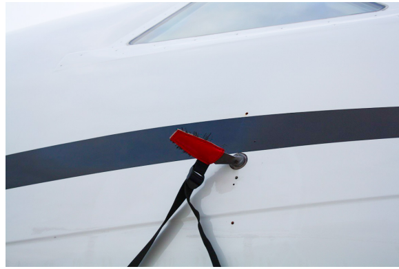
Grumman Gulfstream G-V Rosemont/TAT Cover Falcon Jet 2000 Pitot Covers, Aoa's, Tat Cover Set, Heat Resistant Type