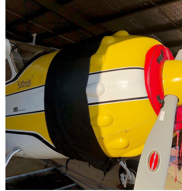
Cessna 195 Engine Plugs, Cowl Ring Gap Cover