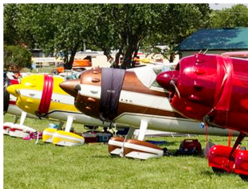
Cessna 190 & 195 Engine Cowl Ring Gap Cover