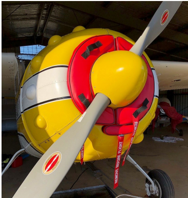
Cessna 195 Engine Plugs