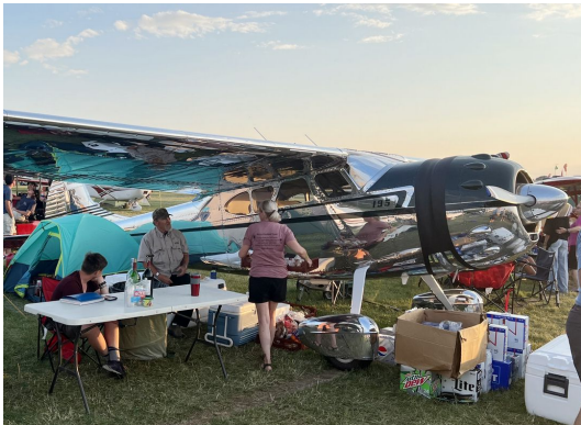
Cessna 190 & 195 Engine Cowl Ring Gap Cover, Open Bottom