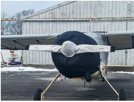
Cessna 190 Travel Canopy, Insulated Engine, Wing & Prop Covers