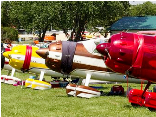
Cessna 190 & 195 Engine Cowl Ring Gap Cover

This cover type is made from Silver Acrylic Sunbrella canvas and is 100% lined with a soft and smooth microfiber. Bruce's Custom Covers developed this material combination especially for aircraft protection. The outer material is medium weight and treated for water resistance, UV resistance and anti-static buildup. The inner lining is a very soft and smooth microfiber to prevent scratching. The material is very reflective, and tests show that the cabin interior temperature can be reduced to near-ambient temperature on the hottest of days. It is water, ice and snow repellent, yet breathable to allow moisture to escape from between the cover and the aircraft surface.