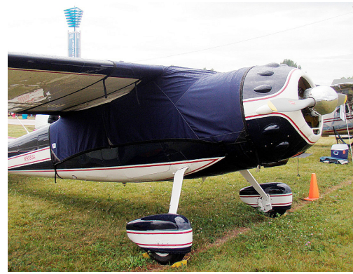
Cessna 195 Canopy Cover, extended forward and over gas caps Cessna 195 Canopy Cover, extended forward and over gas caps