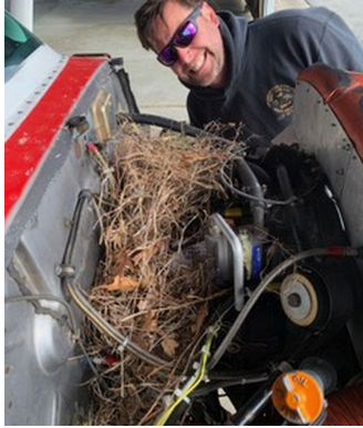
Cessna 172 Bird Nest Problem

Engine Inlet Plugs are custom fit for your Cessna 190 & 195 intakes, made with heavy-duty vinyl material, and stuffed with a single block of sculpted urethane foam. Each plug has a zipper that allows the foam to be removed and dried if necessary. Engine plugs have warning flags that are visible from the cockpit or 'remove before flight' streamers sewn onto the face of the plugs. Most plugs are imprinted with the aircraft registration number in black for an extra charge. Storage bag NOT included. Engine plugs may be inserted after flight when the engine is still warm. Engine Inlet Plugs are commonly referred to as Cowl Plugs, Intake Plugs, Cowl Blocks, Engine Blocks, and Engine Bungs.