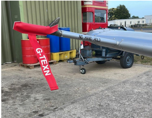
T6 Harvard Pitot Cover, shark fin type

Engine Inlet Plugs are custom fit for your Cessna 190 & 195 intakes, made with heavy-duty vinyl material, and stuffed with a single block of sculpted urethane foam. Each plug has a zipper that allows the foam to be removed and dried if necessary. Engine plugs have warning flags that are visible from the cockpit or 'remove before flight' streamers sewn onto the face of the plugs. Most plugs are imprinted with the aircraft registration number in black for an extra charge. Storage bag NOT included. Engine plugs may be inserted after flight when the engine is still warm. Engine Inlet Plugs are commonly referred to as Cowl Plugs, Intake Plugs, Cowl Blocks, Engine Blocks, and Engine Bungs.