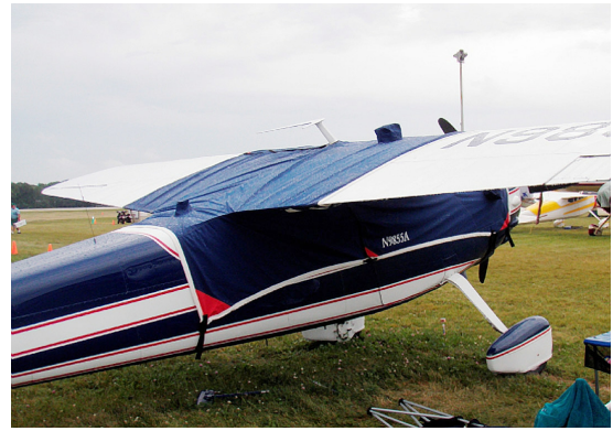
Cessna 195 Canopy Cover, extended forward and over gas caps Cessna 195 Canopy Cover, extended forward and over gas caps