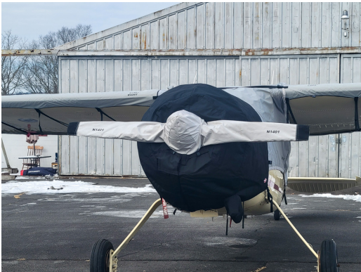
Cessna 190 Travel Canopy, Insulated Engine, Wing & Prop Covers

WINTER USE MATERIAL - Made with Solution-Dyed Polyester fabric, this option is intended for seasonal use to aid in deicing, rain mitigation, or for occasional travel. The material is lighter and more compact, but more susceptible to UV damage and may have a shorter useful life if used continuously outside than the all-year use material.