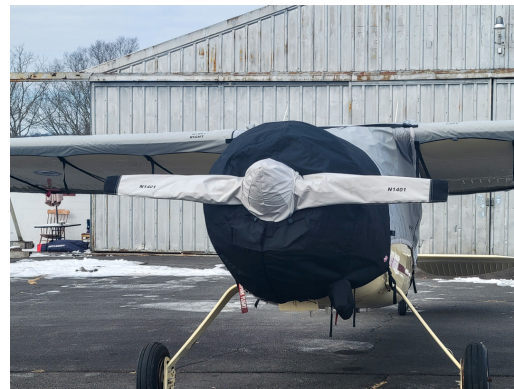
Cessna 190 Travel Canopy, Insulated Engine, Wing & Prop Covers