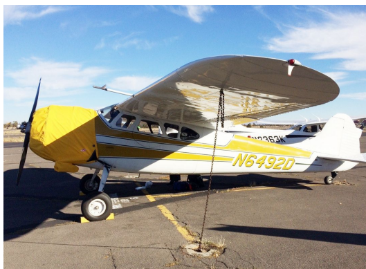
Cessna 195 Engine Cover

This cover type is made from Silver Acrylic Sunbrella canvas and is 100% lined with a soft and smooth microfiber. Bruce's Custom Covers developed this material combination especially for aircraft protection. The outer material is medium weight and treated for water resistance, UV resistance and anti-static buildup. The inner lining is a very soft and smooth microfiber to prevent scratching. The material is very reflective, and tests show that the cabin interior temperature can be reduced to near-ambient temperature on the hottest of days. It is water, ice and snow repellent, yet breathable to allow moisture to escape from between the cover and the aircraft surface.