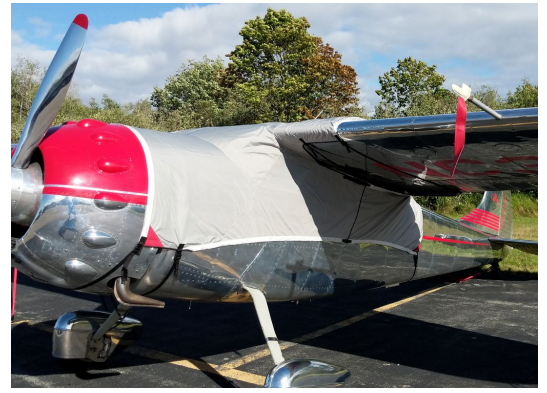
Cessna 195 Travel Weight Over-Top Canopy Cover