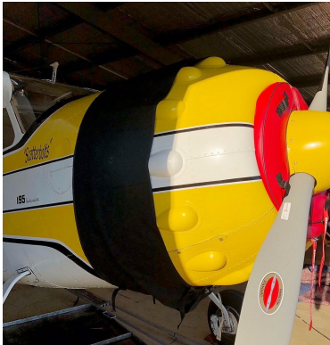
Cessna 195 Engine Plugs, Cowl Ring Gap Cover

Engine Inlet Plugs are custom fit for your Cessna 190 & 195 intakes, made with heavy-duty vinyl material, and stuffed with a single block of sculpted urethane foam. Each plug has a zipper that allows the foam to be removed and dried if necessary. Engine plugs have warning flags that are visible from the cockpit or 'remove before flight' streamers sewn onto the face of the plugs. Most plugs are imprinted with the aircraft registration number in black for an extra charge. Storage bag NOT included. Engine plugs may be inserted after flight when the engine is still warm. Engine Inlet Plugs are commonly referred to as Cowl Plugs, Intake Plugs, Cowl Blocks, Engine Blocks, and Engine Bungs.