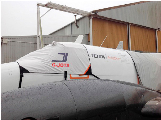
King Air Windshield/Cockpit Cover

The Beech 1900D Nose Cover is designed to cover the section of the fuselage forward of the windshield to the tip of the nose. It is secured with belly strapsThis cover type is made from Silver Acrylic Sunbrella canvas and is 100% lined with a soft and smooth microfiber. Bruce's Custom Covers developed this material combination especially for aircraft protection. The outer material is medium weight and treated for water resistance, UV resistance and anti-static buildup. The inner lining is a very soft and smooth microfiber to prevent scratching. The material is very reflective, and tests show that the cabin interior temperature can be reduced to near-ambient temperature on the hottest of days. It is water, ice and snow repellent, yet breathable to allow moisture to escape from between the cover and the aircraft surface.