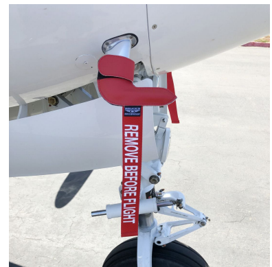
Beech King Air Pitot Covers