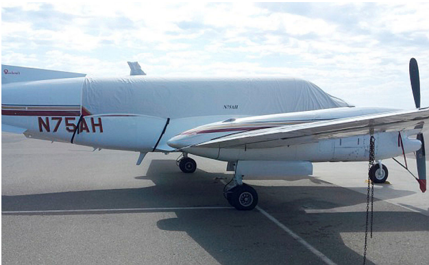
King Air 350 Canopy Cover