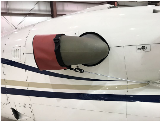
Beech King Air 350 Exhaust Covers