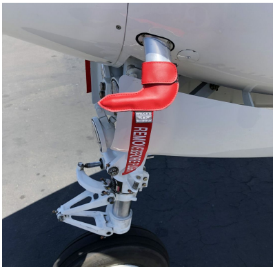
Beech King Air Pitot Covers

Engine Inlet Plugs are custom fit for your Beech 1900D intakes, made with heavy-duty vinyl material, and stuffed with a single block of sculpted urethane foam. Each plug has a zipper that allows the foam to be removed and dried if necessary. Engine plugs have warning flags that are visible from the cockpit or 'remove before flight' streamers sewn onto the face of the plugs. Most plugs are imprinted with the aircraft registration number in black for an extra charge. Storage bag NOT included. Engine plugs may be inserted after flight when the engine is still warm. Engine Inlet Plugs are commonly referred to as Cowl Plugs, Intake Plugs, Cowl Blocks, Engine Blocks, and Engine Bungs.