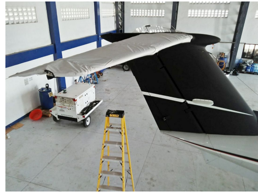
Beech King Air B350 Horizontal Stabilizer Covers