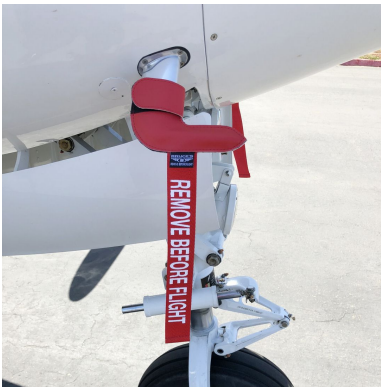
Beech King Air Pitot Covers