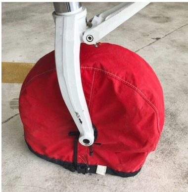
Beech King Air 300 Tire Covers (nose gear)