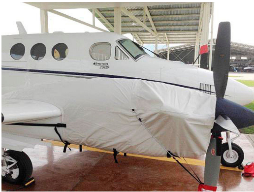
King Air C90 Engine Cover