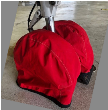
Beech King Air 300 Tire Covers (main gear)

ALL-YEAR USE MATERIAL - Made with Silver Acrylic Sunbrella canvas, the all-year use material is the best option for sun protection and cover longevity. This heavier more durable material is intended for all weather conditions, such as rain and snow or lots of sun.