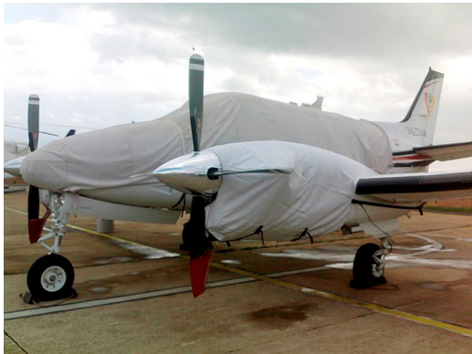
King Air C90 Canopy/Nose Cover, Engine Covers