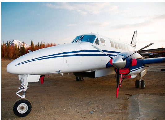
Beech 99 Engine Plugs & Prop Ties

Engine Inlet Plugs are custom fit for your Beech 1900D intakes, made with heavy-duty vinyl material, and stuffed with a single block of sculpted urethane foam. Each plug has a zipper that allows the foam to be removed and dried if necessary. Engine plugs have warning flags that are visible from the cockpit or 'remove before flight' streamers sewn onto the face of the plugs. Most plugs are imprinted with the aircraft registration number in black for an extra charge. Storage bag NOT included. Engine plugs may be inserted after flight when the engine is still warm. Engine Inlet Plugs are commonly referred to as Cowl Plugs, Intake Plugs, Cowl Blocks, Engine Blocks, and Engine Bungs.