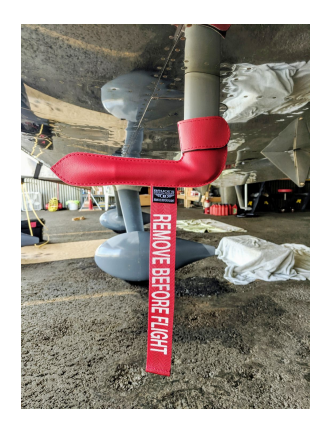
Van's RV-14 Pitot Cover