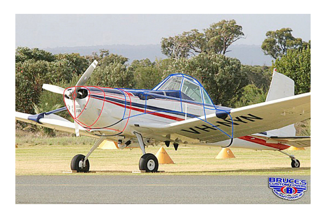
Cessna Ag Truck Canopy/Hopper and Engine Covers (illustration)

This cover type is made from Silver Acrylic Sunbrella canvas and is 100% lined with a soft and smooth microfiber. Bruce's Custom Covers developed this material combination especially for aircraft protection. The outer material is medium weight and treated for water resistance, UV resistance and anti-static buildup. The inner lining is a very soft and smooth microfiber to prevent scratching. The material is very reflective, and tests show that the cabin interior temperature can be reduced to near-ambient temperature on the hottest of days. It is water, ice and snow repellent, yet breathable to allow moisture to escape from between the cover and the aircraft surface.