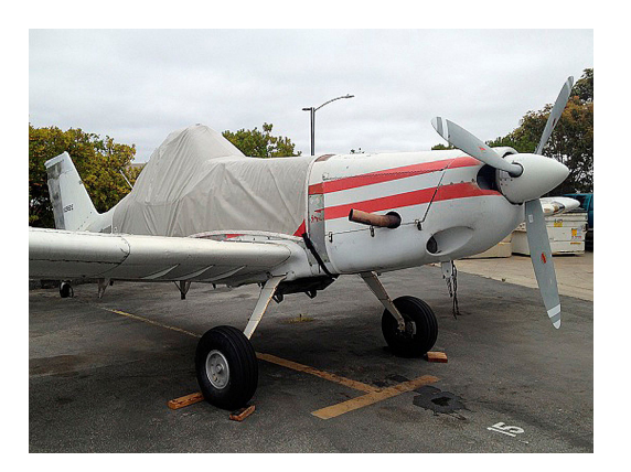
Piper Brave PA-36 Canopy/Hopper Cover