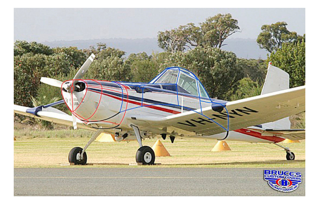
Cessna Ag Truck Canopy/Hopper and Engine Covers (illustration)