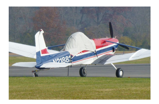
Cessna 188 Ag Truck Canopy Cover

Travel Covers are made with Silver Solution-Dyed Polyester fabric and only lined over the windshield to save weight. The material is lightweight and more compact for easy stowage in the aircraft. The polyester material is water resistant, but only intended for occasional use outside. We also have an ultra lightweight material available for fitted hangar dust covers. For daily outdoor use, the non-travel Sunbrella Cover is the best choice.