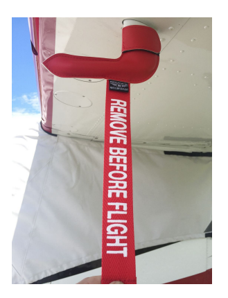
Cessna A185F Pitot Cover