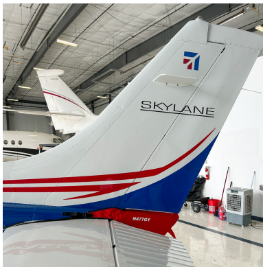
Textron Aviation Inc 182T Tailcone Cover

WINTER USE MATERIAL - Made with Solution-Dyed Polyester fabric, this option is intended for seasonal use to aid in deicing, rain mitigation, or for occasional travel. The material is lighter and more compact, but more susceptible to UV damage and may have a shorter useful life if used continuously outside than the all-year use material.