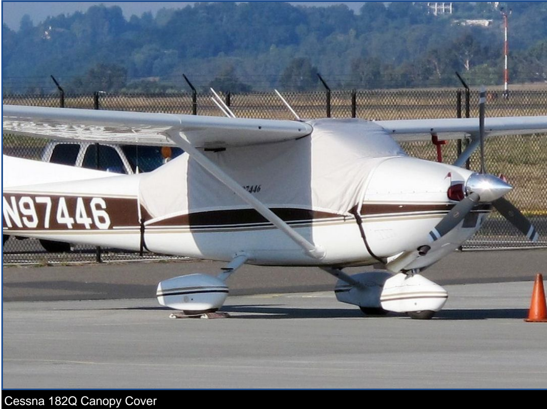
Cessna 182Q Canopy Cover