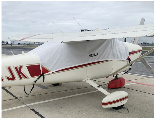
Cessna 182 Skylane Canopy, Prop & Nose Wheelpant Covers

The Cessna 182 Skylane Tailcone Cover fits onto the tailcone area to cover the holes that birds can fly into and nest. The cover easily straps onto the leading edge of the horizontal stabilizer with padded hooks or overlaps with the elevators slightly and attaches under the horizontal stabilizers with adjustable straps. Tailcone Covers are normally made with Solution-Dyed Polyester or Acrylic Sunbrella .