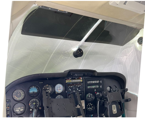
Cessna 182 Cockpit HeatShield Set