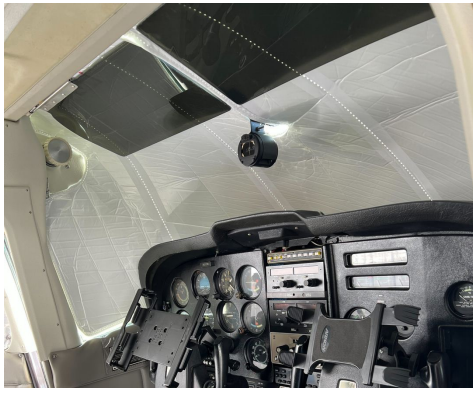
Cessna 182 Cockpit HeatShield Set