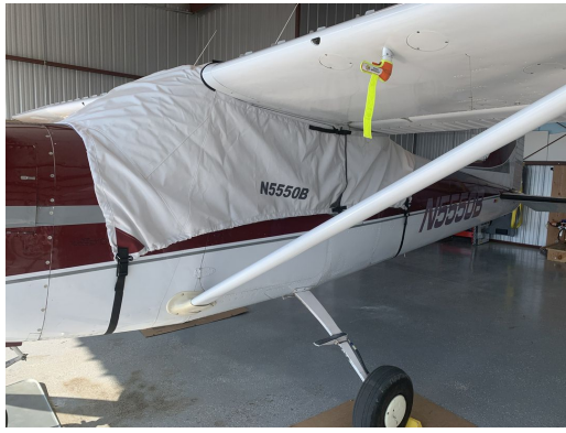
Cessna 182D Skylane Wrap-Around Canopy Cover