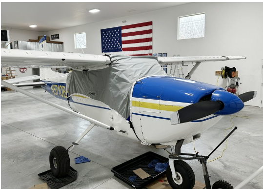
Cessna 182 Light Weight Wrap Around Canopy Cover

Travel Covers are made with Silver Solution-Dyed Polyester fabric and only lined over the windshield to save weight. The material is lightweight and more compact for easy stowage in the aircraft. The polyester material is water resistant, but only intended for occasional use outside. We also have an ultra lightweight material available for fitted hangar dust covers. For daily outdoor use, the non-travel Sunbrella Cover is the best choice.