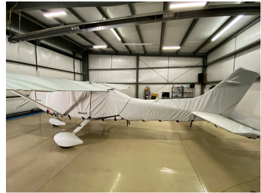
182 Skylane T182T Extended Canopy Cover