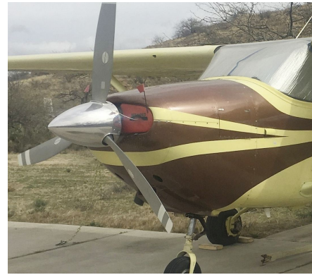
Cessna 182A Engine Inlet Plugs