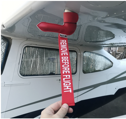
Cessna 182 Skylane Pitot Cover

Engine Inlet Plugs are custom fit for your Cessna 182 Skylane intakes, made with heavy-duty vinyl material, and stuffed with a single block of sculpted urethane foam. Each plug has a zipper that allows the foam to be removed and dried if necessary. Engine plugs have warning flags that are visible from the cockpit or 'remove before flight' streamers sewn onto the face of the plugs. Most plugs are imprinted with the aircraft registration number in black for an extra charge. Storage bag NOT included. Engine plugs may be inserted after flight when the engine is still warm. Engine Inlet Plugs are commonly referred to as Cowl Plugs, Intake Plugs, Cowl Blocks, Engine Blocks, and Engine Bungs.