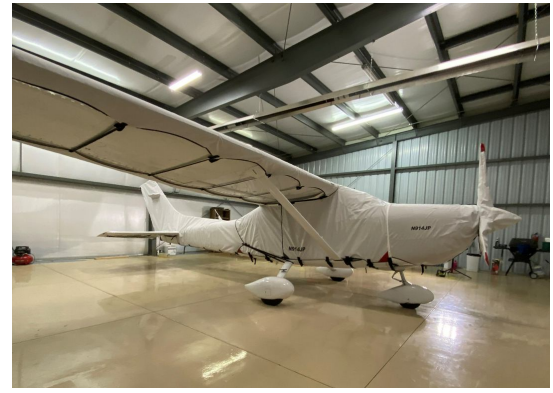
182 Skylane T182T Wing Covers