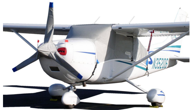
Cessna 182 Canopy Cover, Engine Plugs, 3-Blade Prop Cover