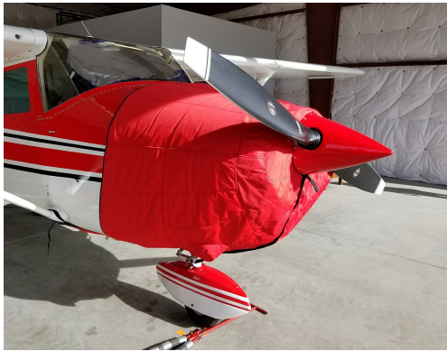
Cessna 182 Fully enclosed insulated engine cover.

This cover type is made from Silver Acrylic Sunbrella canvas and is 100% lined with a soft and smooth microfiber. Bruce's Custom Covers developed this material combination especially for aircraft protection. The outer material is medium weight and treated for water resistance, UV resistance and anti-static buildup. The inner lining is a very soft and smooth microfiber to prevent scratching. The material is very reflective, and tests show that the cabin interior temperature can be reduced to near-ambient temperature on the hottest of days. It is water, ice and snow repellent, yet breathable to allow moisture to escape from between the cover and the aircraft surface.