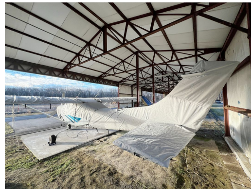
Cessna R182 Canopy, Engine, Wings, Empennage Covers