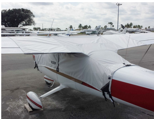
Cessna 177B Cardinal Canopy Cover, Over-Top, Ext. to cover gas caps, 6" fwd extension.