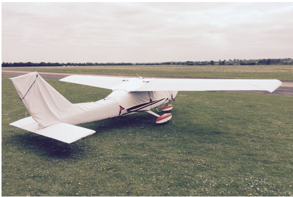
Cessna Cardinal Full Cover Set

This cover type is made from Silver Acrylic Sunbrella canvas and is 100% lined with a soft and smooth microfiber. Bruce's Custom Covers developed this material combination especially for aircraft protection. The outer material is medium weight and treated for water resistance, UV resistance and anti-static buildup. The inner lining is a very soft and smooth microfiber to prevent scratching. The material is very reflective, and tests show that the cabin interior temperature can be reduced to near-ambient temperature on the hottest of days. It is water, ice and snow repellent, yet breathable to allow moisture to escape from between the cover and the aircraft surface.