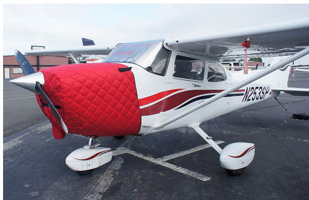
Cessna 172 Insulated Engine Cover, fully enclosed

This cover type is made from Silver Acrylic Sunbrella canvas and is 100% lined with a soft and smooth microfiber. Bruce's Custom Covers developed this material combination especially for aircraft protection. The outer material is medium weight and treated for water resistance, UV resistance and anti-static buildup. The inner lining is a very soft and smooth microfiber to prevent scratching. The material is very reflective, and tests show that the cabin interior temperature can be reduced to near-ambient temperature on the hottest of days. It is water, ice and snow repellent, yet breathable to allow moisture to escape from between the cover and the aircraft surface.