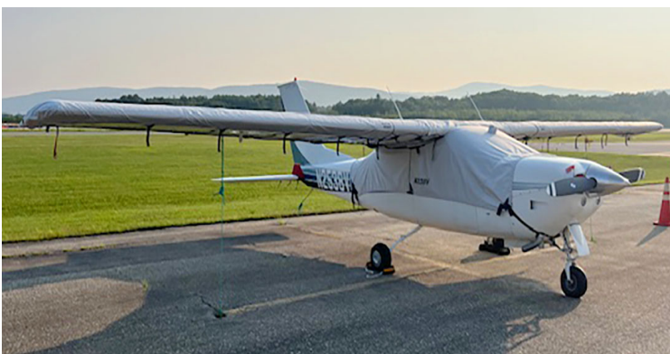
Cessna 177 Cardinal Over-Top Canopy Cover, extends to cover gas caps, & Wing Covers