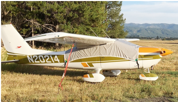
Cessna 177 Cardinal Travel Cover, Light Weight Travel Canopy Cover (Wrap Around), 6 Lbs