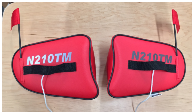
Cessna 210 Engine Inlet Plugs