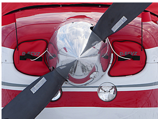
Cessna Cardinal 177B Engine Plugs

Engine Inlet Plugs are custom fit for your Cessna 177 Cardinal intakes, made with heavy-duty vinyl material, and stuffed with a single block of sculpted urethane foam. Each plug has a zipper that allows the foam to be removed and dried if necessary. Engine plugs have warning flags that are visible from the cockpit or 'remove before flight' streamers sewn onto the face of the plugs. Most plugs are imprinted with the aircraft registration number in black for an extra charge. Storage bag NOT included. Engine plugs may be inserted after flight when the engine is still warm. Engine Inlet Plugs are commonly referred to as Cowl Plugs, Intake Plugs, Cowl Blocks, Engine Blocks, and Engine Bungs.