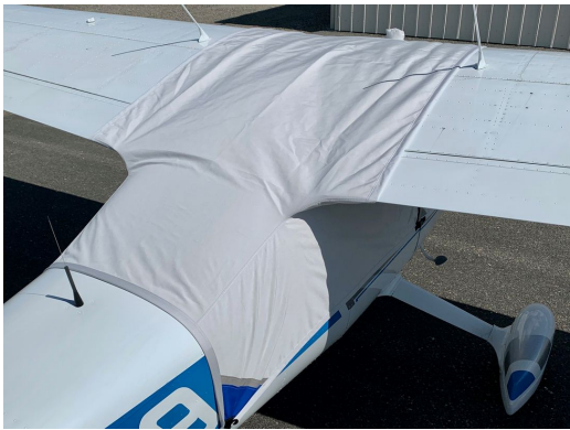
Cessna Cardinal 177 Over-Top Canopy Cover