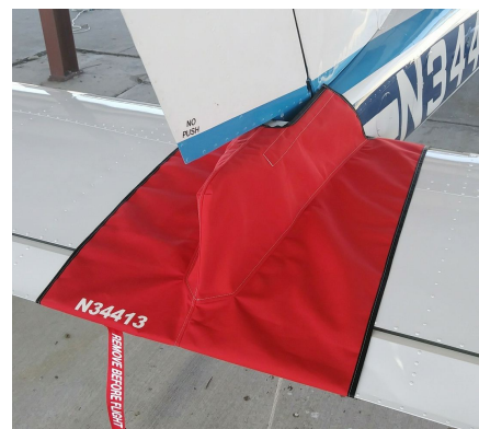
Cessna Cardinal Tailcone Cover

WINTER USE MATERIAL - Made with Solution-Dyed Polyester fabric, this option is intended for seasonal use to aid in deicing, rain mitigation, or for occasional travel. The material is lighter and more compact, but more susceptible to UV damage and may have a shorter useful life if used continuously outside than the all-year use material.