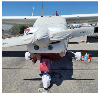
Cessna 177RG Tire & Prop Covers

ALL-YEAR USE MATERIAL - Made with Silver Acrylic Sunbrella canvas, the all-year use material is the best option for sun protection and cover longevity. This heavier more durable material is intended for all weather conditions, such as rain and snow or lots of sun.