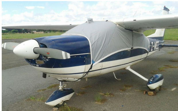
Cessna 177 Cardinal Travel Canopy Cover

Travel Covers are made with Silver Solution-Dyed Polyester fabric and only lined over the windshield to save weight. The material is lightweight and more compact for easy stowage in the aircraft. The polyester material is water resistant, but only intended for occasional use outside. We also have an ultra lightweight material available for fitted hangar dust covers. For daily outdoor use, the non-travel Sunbrella Cover is the best choice.