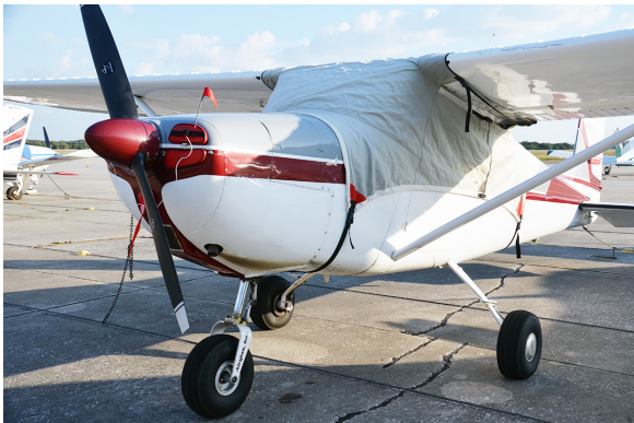
Cessna 172/175 Over-Top Canopy Cover (early models), Engine Inlet Plugs

Engine Inlet Plugs are custom fit for your Cessna 172 & 175 (T-41) intakes, made with heavy-duty vinyl material, and stuffed with a single block of sculpted urethane foam. Each plug has a zipper that allows the foam to be removed and dried if necessary. Engine plugs have warning flags that are visible from the cockpit or 'remove before flight' streamers sewn onto the face of the plugs. Most plugs are imprinted with the aircraft registration number in black for an extra charge. Storage bag NOT included. Engine plugs may be inserted after flight when the engine is still warm. Engine Inlet Plugs are commonly referred to as Cowl Plugs, Intake Plugs, Cowl Blocks, Engine Blocks, and Engine Bungs.