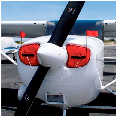
Cessna 172 Engine Plugs