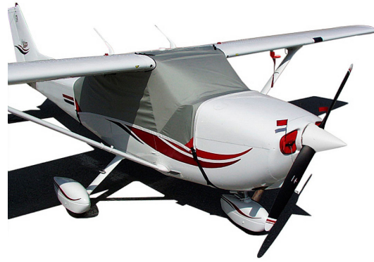
Cessna 172 Standard Canopy Cover