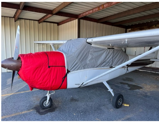
Cessna 172K Insulated Engine Cover, Travel Weight Canopy Cover