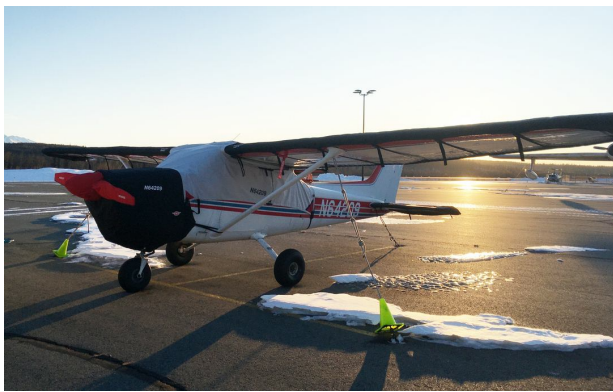
Cessna 172M Canopy, Wings, Horiz. Stab., Insulated Engine & Prop Covers