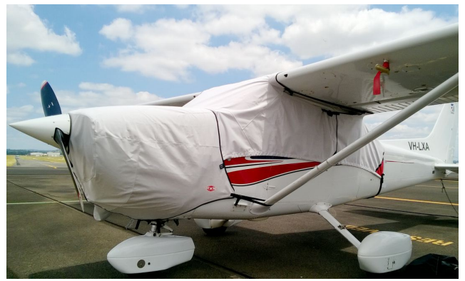
Cessna 172 Canopy & Engine Covers