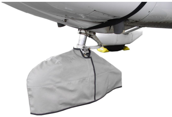
Cessna 172 Nose Gear Fairing Cover