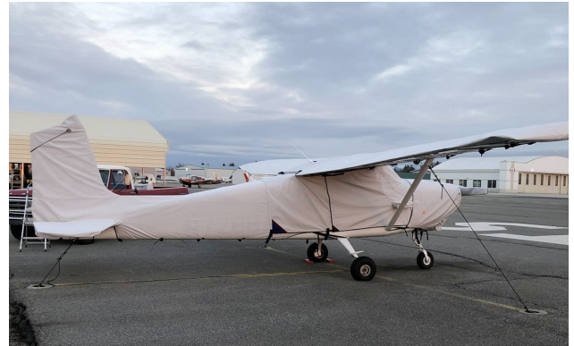
Cessna 172 Extended Canopy, Wing & Engine Covers