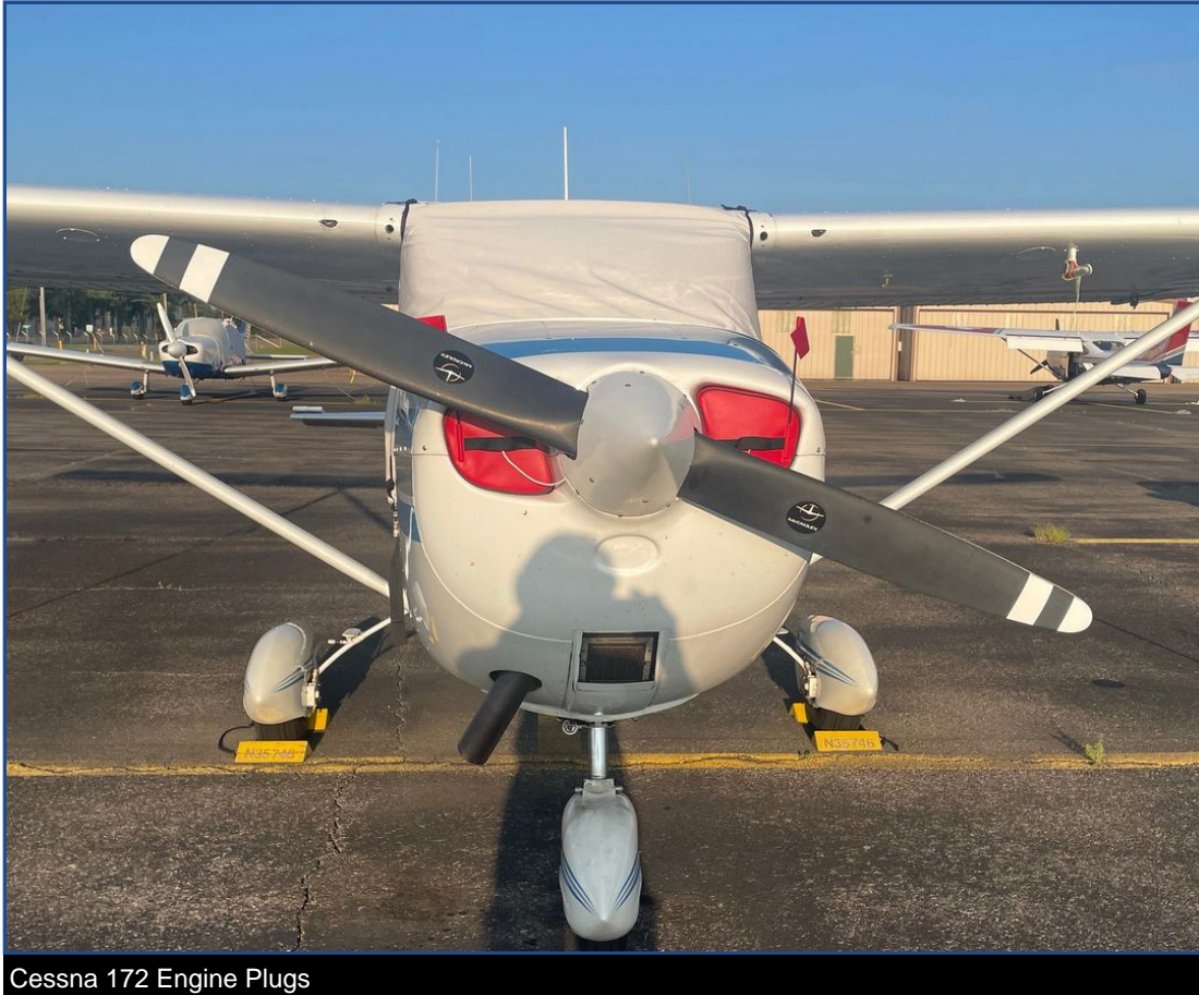
Cessna 172 Engine Plugs