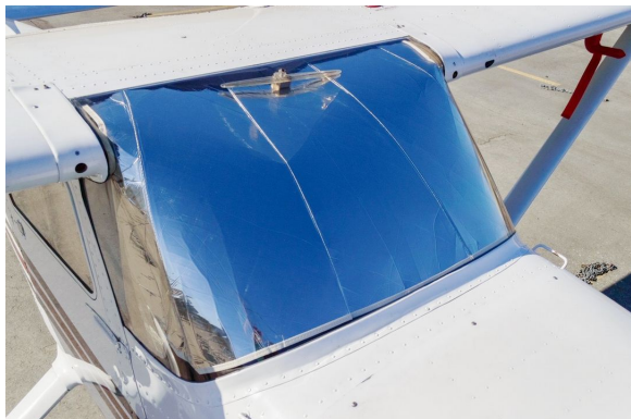
Cessna 172 Windshield HeatShield

Windshield Heatshields are interior sunshades for an aircraft's front windshield. The product is a unique composite of closed-cell foam with a silver mylar finish. The semi-rigid design is stiff enough to stand along the inside of the windshield using sun visors or window framing. It folds up flat and easily stores in the included storage sleeve. Some designs may require velcro and suction cups or split right and left sides. A Heatshield is an excellent short-term remedy for cockpit overheating. An external fabric cover is far more effective and practical for long-term protection.