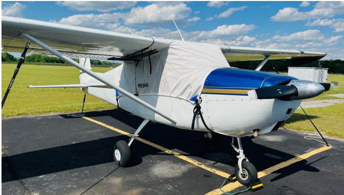
Cessna 172 Canopy Cover Over the top, Ext. over gas caps

This cover type is made from Silver Acrylic Sunbrella canvas and is 100% lined with a soft and smooth microfiber. Bruce's Custom Covers developed this material combination especially for aircraft protection. The outer material is medium weight and treated for water resistance, UV resistance and anti-static buildup. The inner lining is a very soft and smooth microfiber to prevent scratching. The material is very reflective, and tests show that the cabin interior temperature can be reduced to near-ambient temperature on the hottest of days. It is water, ice and snow repellent, yet breathable to allow moisture to escape from between the cover and the aircraft surface.