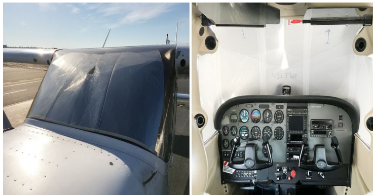
Cessna 172 Windshield HeatShield