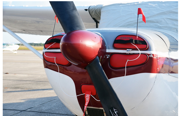
Cessna 172 & 175 (T-41, T-41A/C) Engine Inlet Plugs (Specify Model And Year)