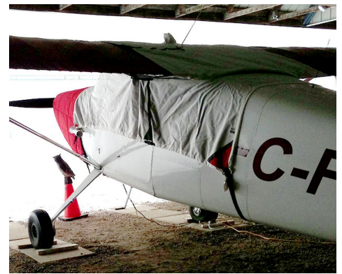
Cessna 170 Insulated Engine Cover