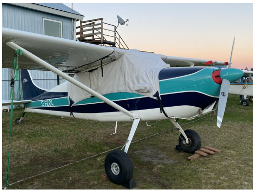
Cessna 170B Over The Top Style Canopy Cover & Engine Plugs