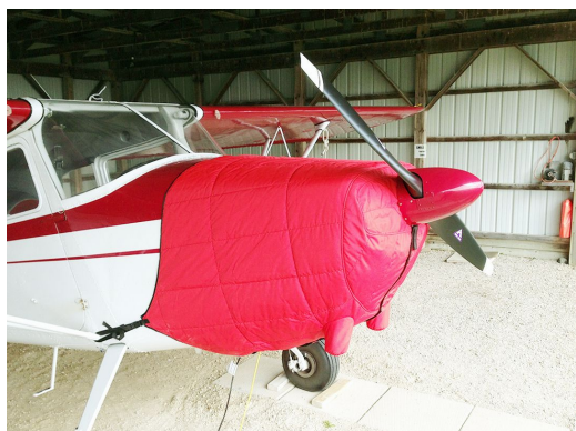
Cessna 170 Insulated Engine Cover

This cover type is made from Silver Acrylic Sunbrella canvas and is 100% lined with a soft and smooth microfiber. Bruce's Custom Covers developed this material combination especially for aircraft protection. The outer material is medium weight and treated for water resistance, UV resistance and anti-static buildup. The inner lining is a very soft and smooth microfiber to prevent scratching. The material is very reflective, and tests show that the cabin interior temperature can be reduced to near-ambient temperature on the hottest of days. It is water, ice and snow repellent, yet breathable to allow moisture to escape from between the cover and the aircraft surface.