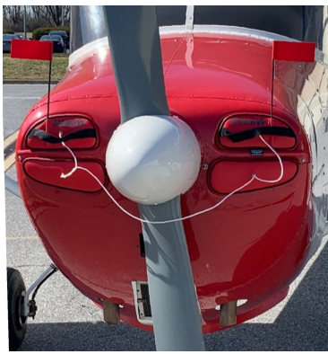
Cessna 170 Engine Plugs