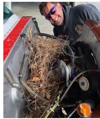
Cessna 172 Bird Nest Problem