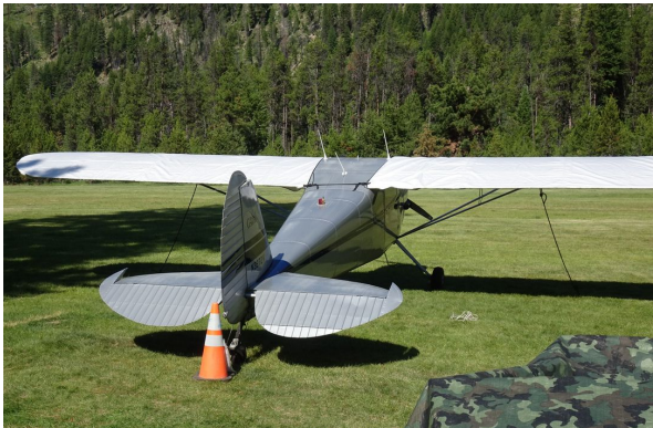
Cessna 170 Wing Covers

WINTER USE MATERIAL - Made with Solution-Dyed Polyester fabric, this option is intended for seasonal use to aid in deicing, rain mitigation, or for occasional travel. The material is lighter and more compact, but more susceptible to UV damage and may have a shorter useful life if used continuously outside than the all-year use material.