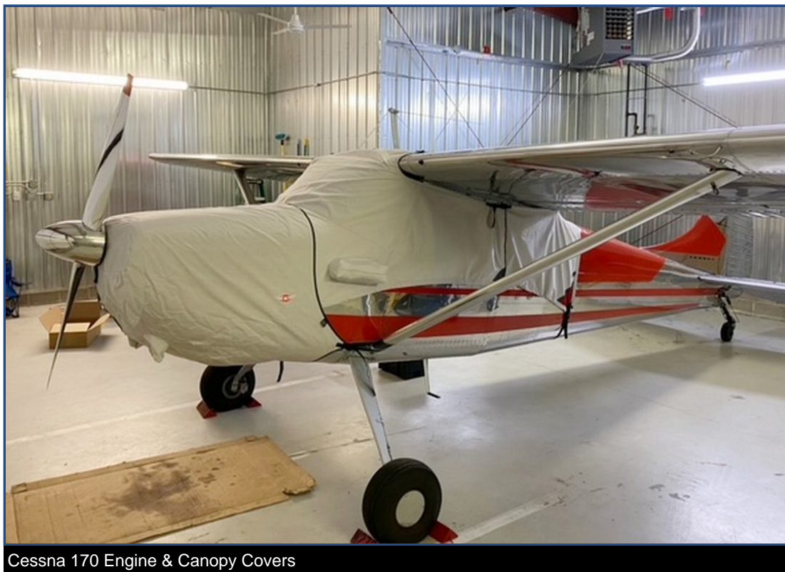
Cessna 170 Engine &amp; Canopy Covers