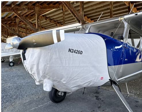
Cessna 170 Engine Cover, Fully Enclosed

This cover type is made from Silver Acrylic Sunbrella canvas and is 100% lined with a soft and smooth microfiber. Bruce's Custom Covers developed this material combination especially for aircraft protection. The outer material is medium weight and treated for water resistance, UV resistance and anti-static buildup. The inner lining is a very soft and smooth microfiber to prevent scratching. The material is very reflective, and tests show that the cabin interior temperature can be reduced to near-ambient temperature on the hottest of days. It is water, ice and snow repellent, yet breathable to allow moisture to escape from between the cover and the aircraft surface.