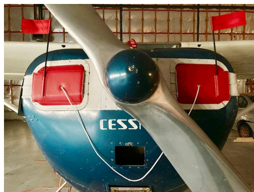
Cessna 170B Engine Inlet Blocking Card