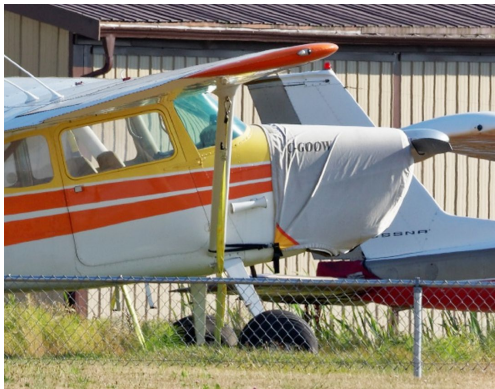
Cessna 170 Engine Cover