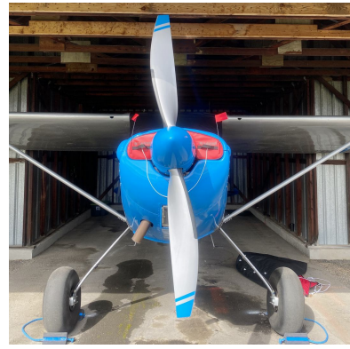
Custom Plugs for Cessna 170 with 180HP lycoming O-360 Engine