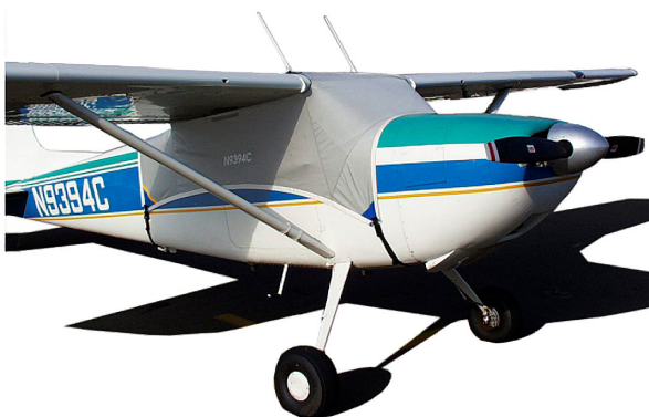
Cessna 180 Canopy Cover

This cover type is made from Silver Acrylic Sunbrella canvas and is 100% lined with a soft and smooth microfiber. Bruce's Custom Covers developed this material combination especially for aircraft protection. The outer material is medium weight and treated for water resistance, UV resistance and anti-static buildup. The inner lining is a very soft and smooth microfiber to prevent scratching. The material is very reflective, and tests show that the cabin interior temperature can be reduced to near-ambient temperature on the hottest of days. It is water, ice and snow repellent, yet breathable to allow moisture to escape from between the cover and the aircraft surface.