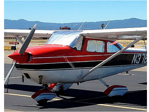
Cessna 172 Cabin HeatShields